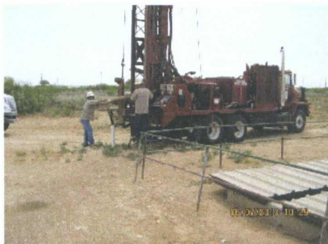
Pulling the monitor well