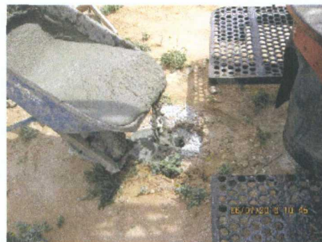
Plugging with a bentonite/concrete slurry