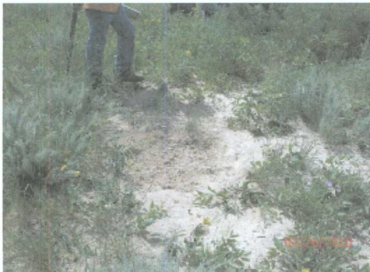
Figure 3 – Photographs of plugging and abandonment of the monitor well at EME State H EOL.