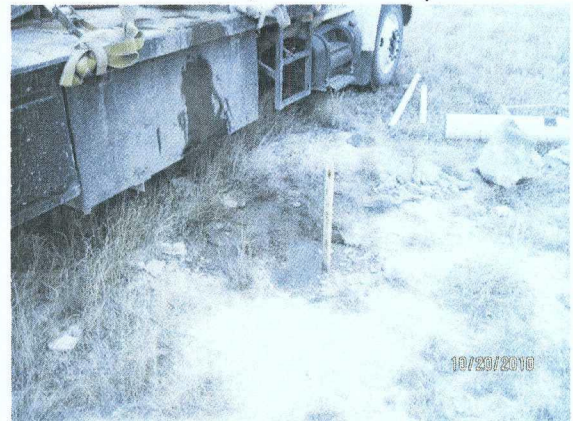
MW-2 at Vacuum G-35 plugged