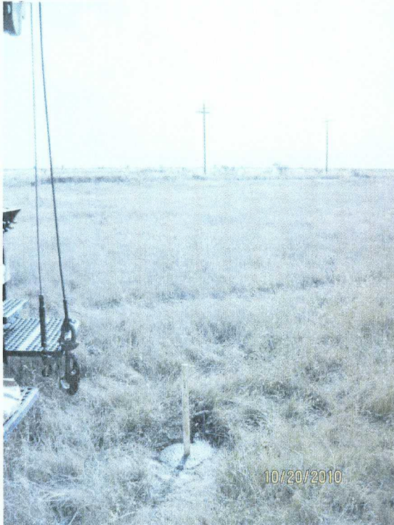
MW-2 at Vacuum F-35 plugged