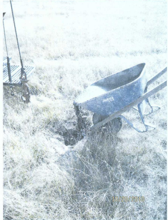
Filling the monitor well with 1-3% bentonite/concrete slurry