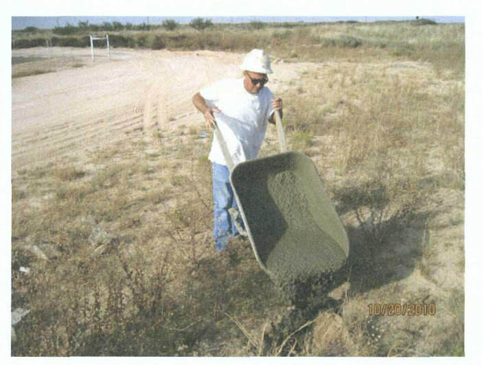
Plugging the monitor well with 1-3% bentonite, concrete slurry