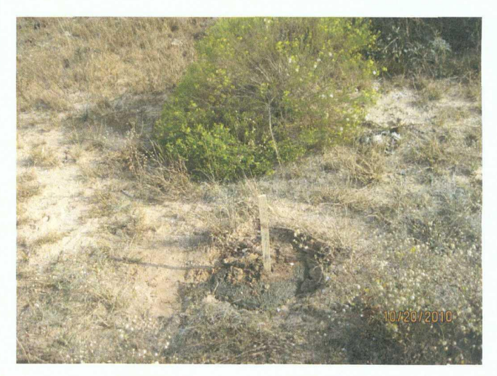
Completed plugging of monitor wells