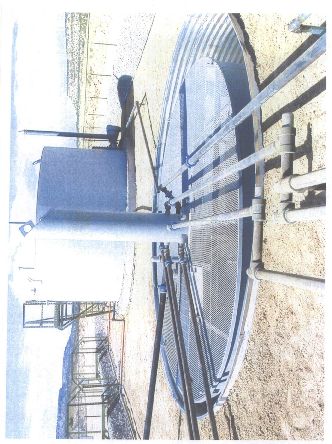
BEFORE THE OIL CONSERVATION COMMISSION CASE NO. 14784 NMOGA EXHIBIT 5-1 HEARING DATE: MAY 14, 2012