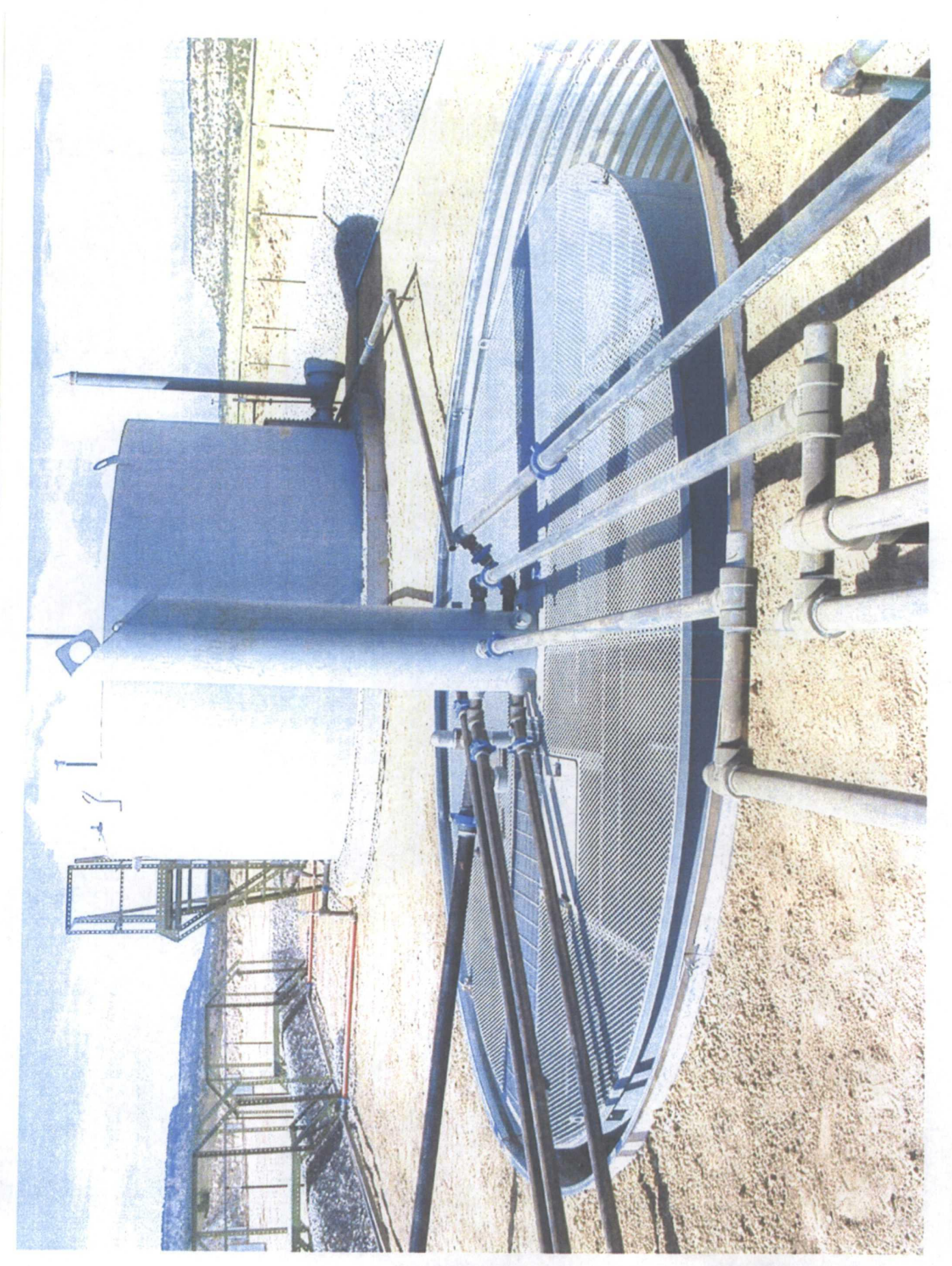
BEFORE THE OIL CONSERVATION COMMISSION CASE NO. 14784 NMOGA EXHIBIT 5-1 HEARING DATE: MAY 14, 2012