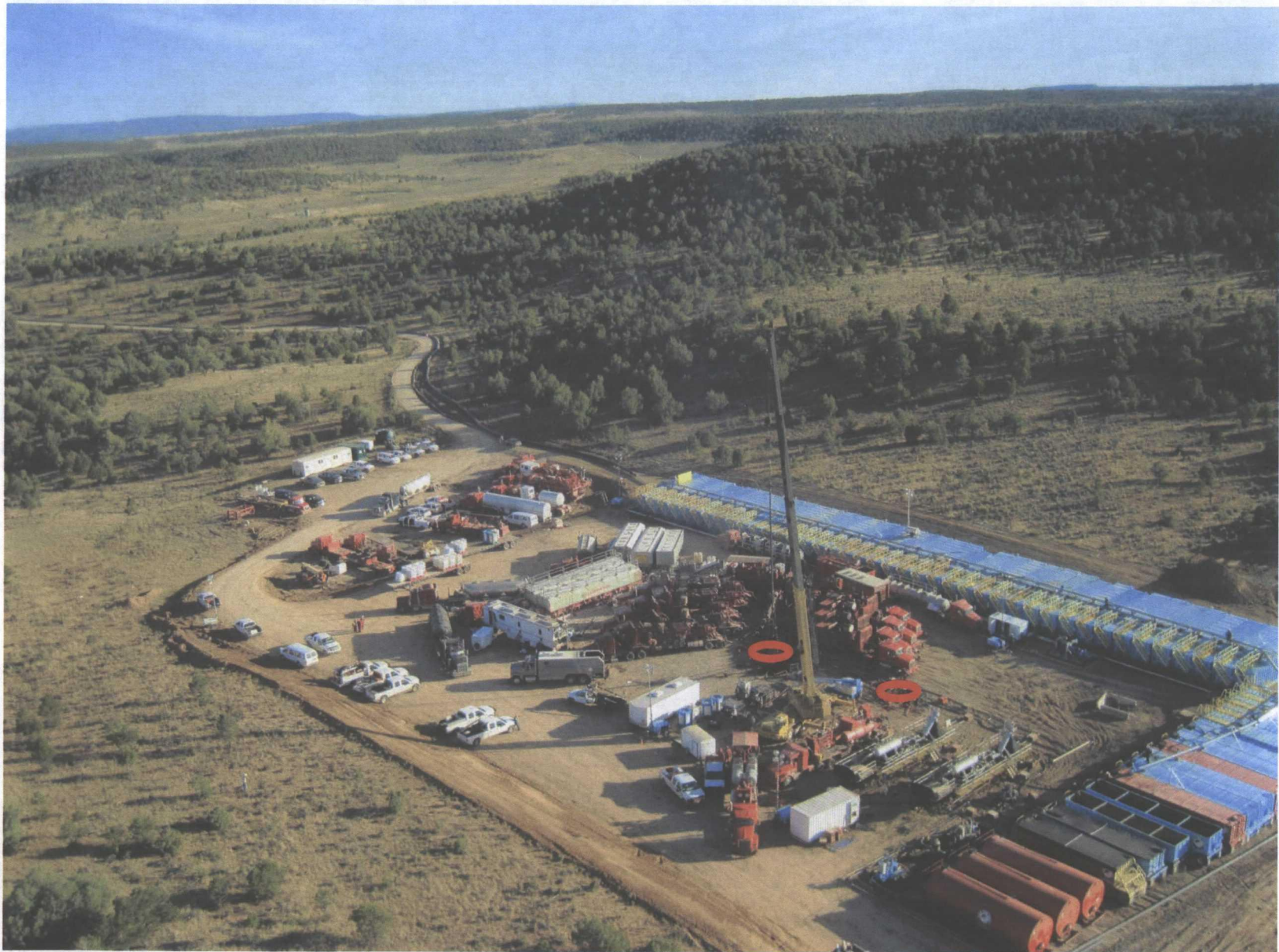
BEFORE THE OIL CONSERVATION COMMISSION CASE NO. 14784 NMOGA EXHIBIT 7-3 HEARING DATE: MAY 14, 2012