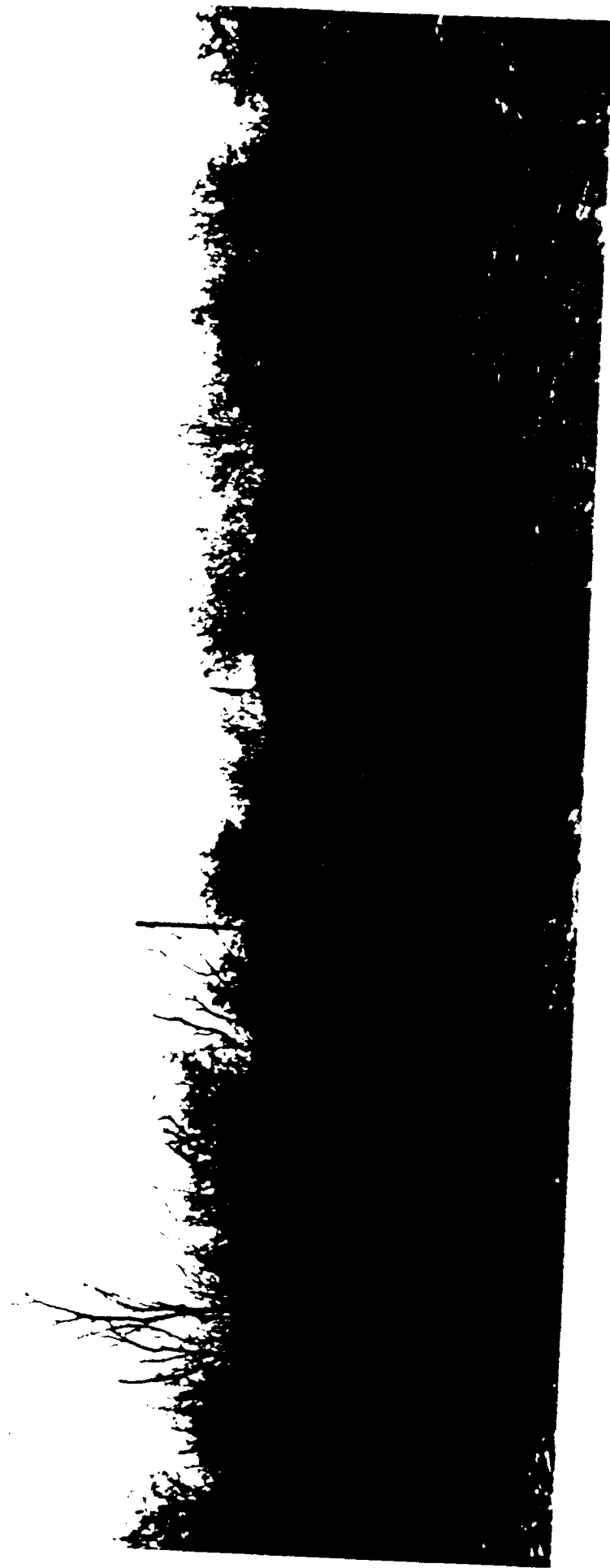
Looking N from original location to current location EXHIBIT 9A