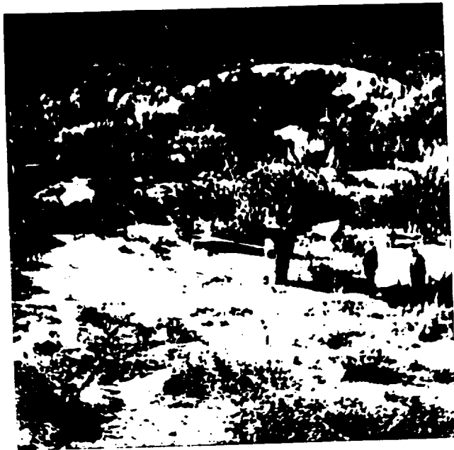
A L Dawsey El Vado #1 N-11-27N-1E