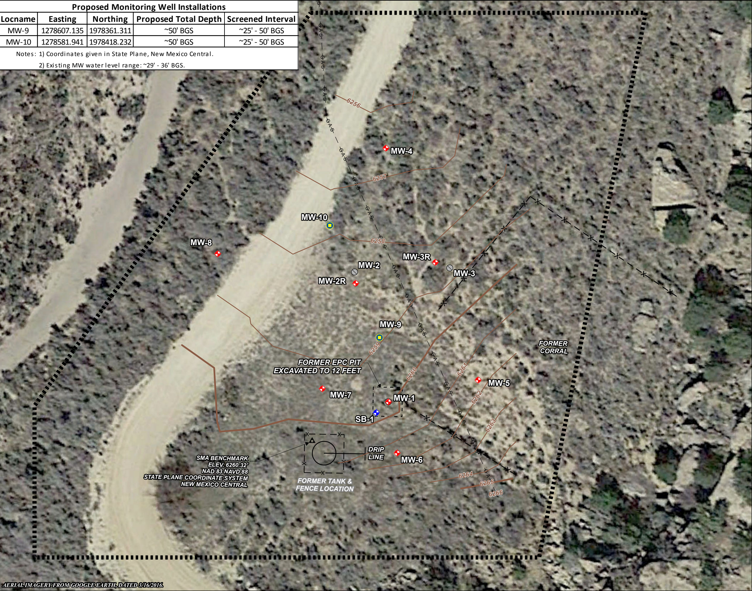
AERIAL IMAGERY FROM GOOGLE EARTH, DATED 8/16/2016.