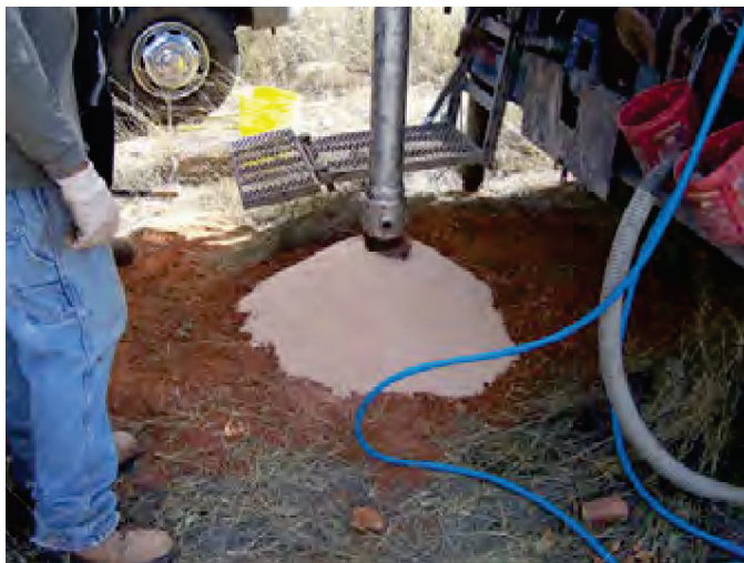
Photograph 11. HSA drilling through caliche in CH-2.