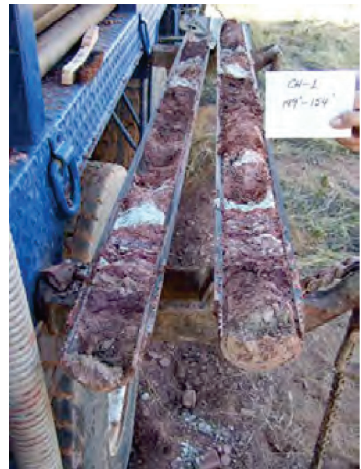
Photograph 8. Core sample at base of CH-1 (Chinle).