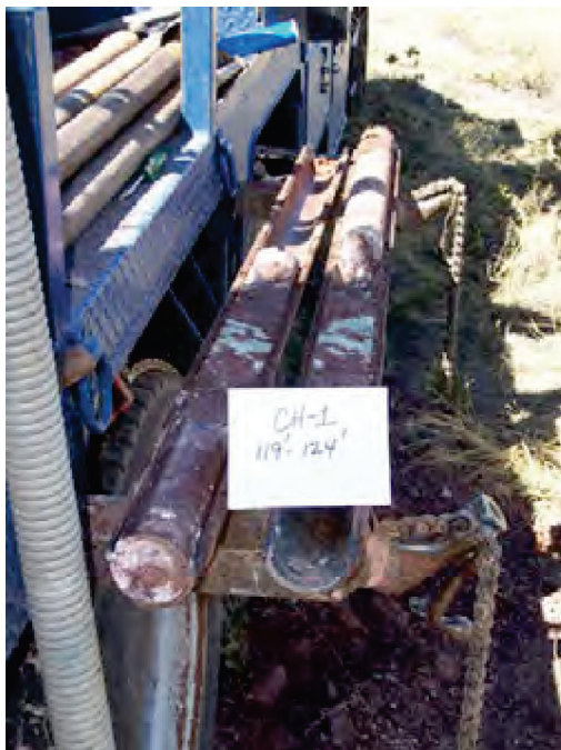
Photograph 7. Core sample of claystone with grey clay inclusions (Chinle) in CH-1.