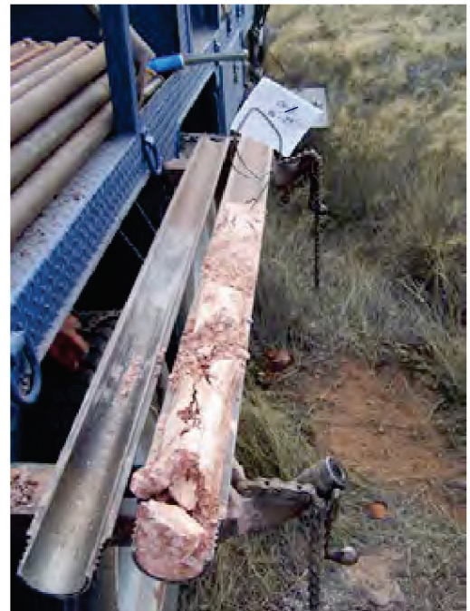
Photograph 12. Core sample of CH-2 at the base of the OAG near the top of Chinle.