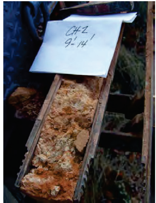
Photograph 10. Core sample of OAG in CH-2.