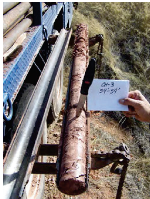
Photograph 20. Core sample claystone (Chinle) in CH-3.