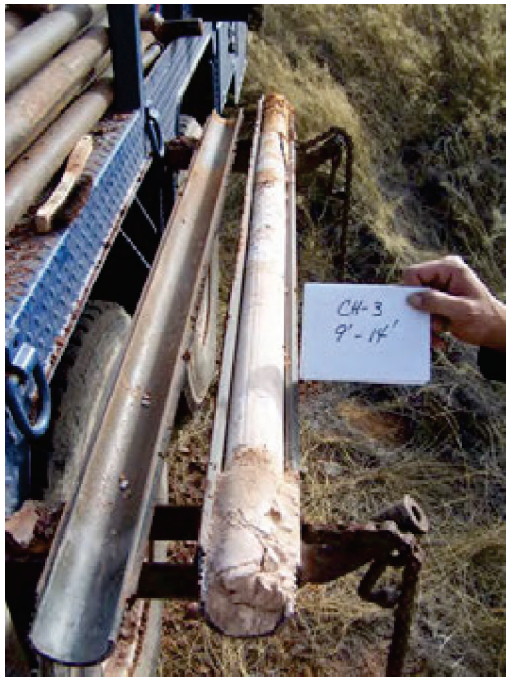
Photograph 17. Core sample of caliche in CH-3.