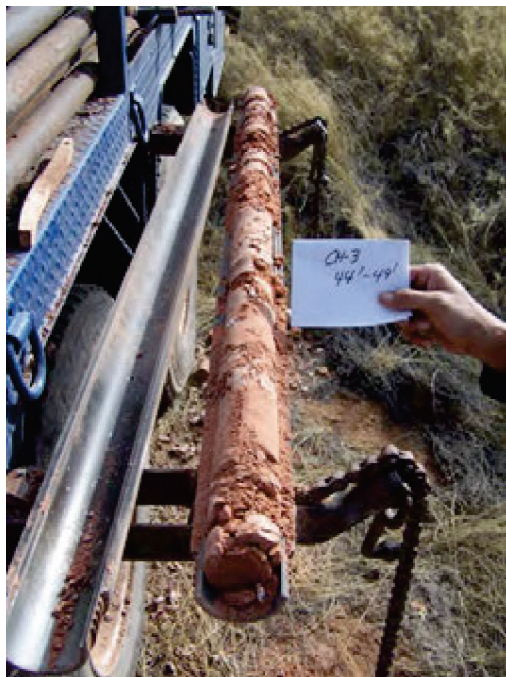
Photograph 19. Core sample of base of OAG and top of Chinle in CH-3.