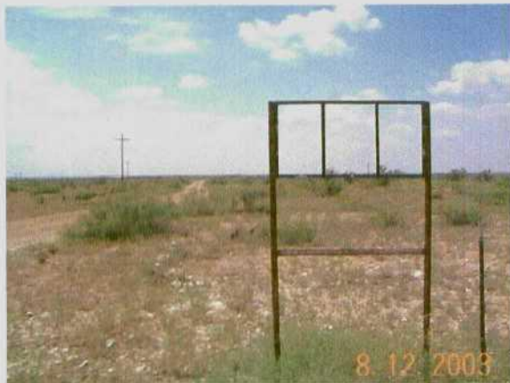
Photo 2: Facility Sign at Landfarm gate entrance is missing. Looking south into the landfarm.