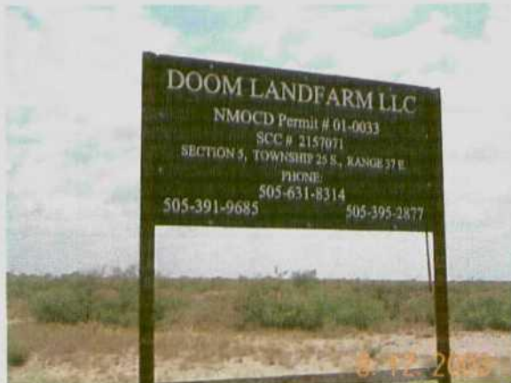
Photo 1: Facility sign at the Highway. Contains Facility name, Permit Number, Legal location and Emergency phone numbers. Looking East