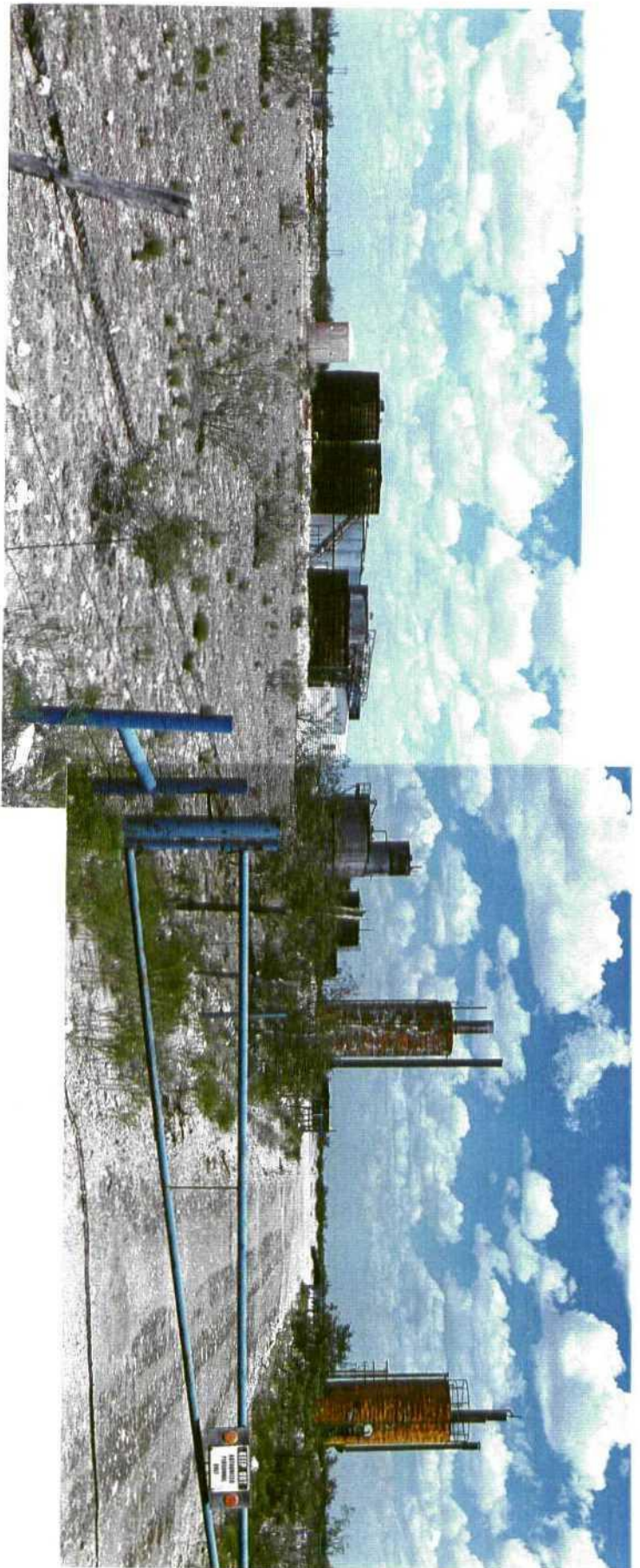
SEC. 31, T18S, R37E, LOT 2, LOOKING EAST AT TREATING PLANT