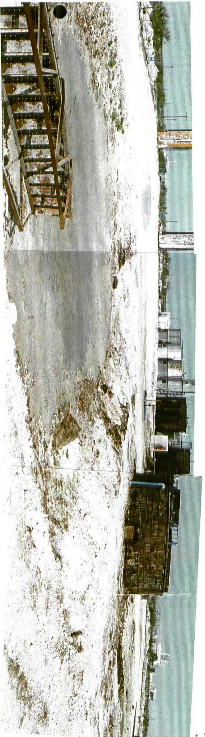
PHOTO TAKEN FROM SOUTHEAST CORNER OF FACILITY LOOKING WEST AND NORTH SHOWING OPEN DISCHARGE PIT