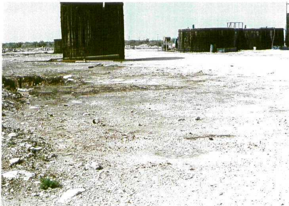
PHOTOS SHOWING NUMEROUS SPILLS EN --SA-09