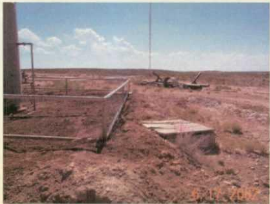
Wastewater tank, different view. Berming needs work. Yates will address and send pictures when work is complete.