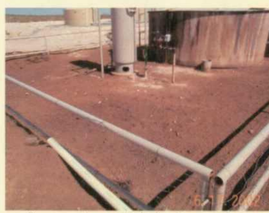
Same wastewater tank showing overflow.