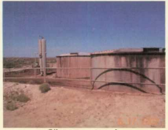
Oily waste water tank.