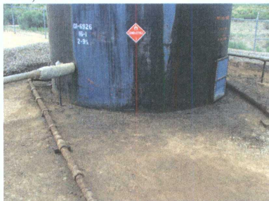
Photo 3: Discharge around AST noted in Photo 1. Unlined bermed area.