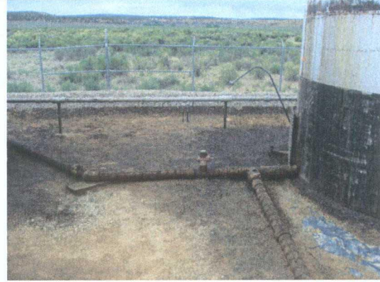
Photo 4: Discharge around AST noted in Photo 2. Unlined bermed area.