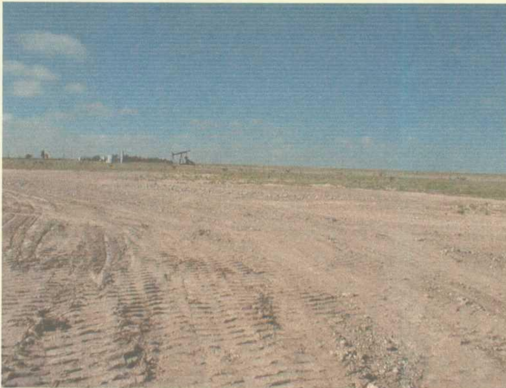
Halliburton North & South Pit after Final Backfilling and Contouring August 27, 1998

Below is a photograph of the backfilled and contoured pit.