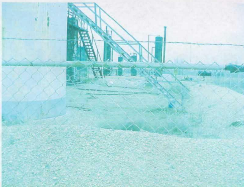
Photo of East Side of Site Looking North