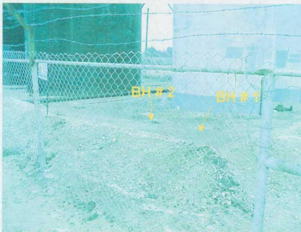
Photo of Drill Site