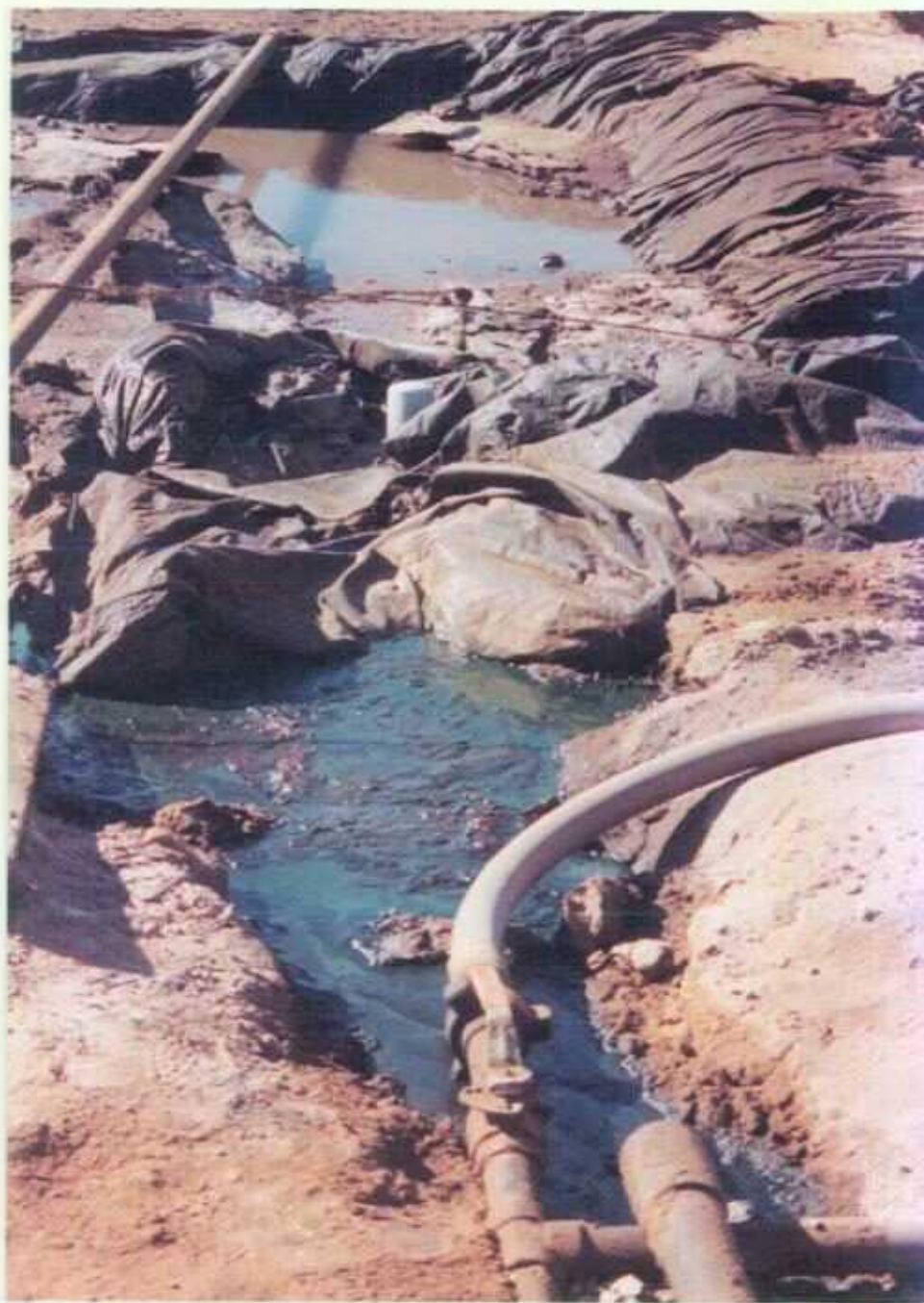
Pits overflowing before liner