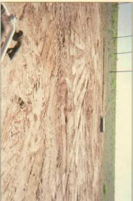
Backfilled site with new box in foreground 5/6/2004