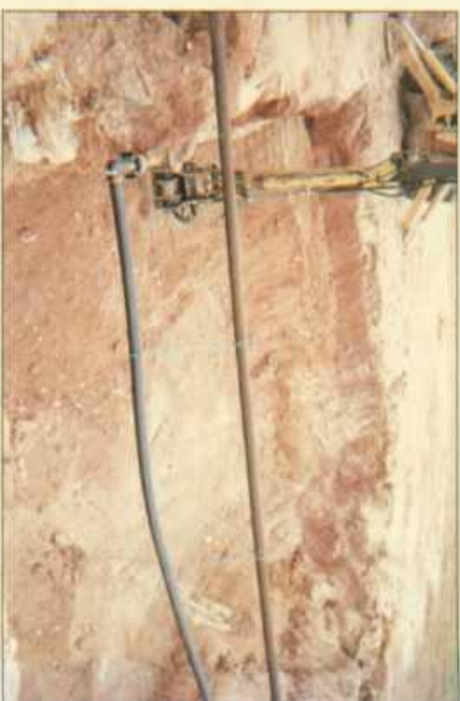
Final excavation: 23 x 20 x 12-ft-deep 3/17/2004