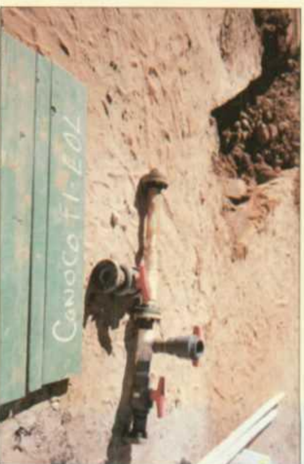
Old box site with old plumbing: lid in foreground