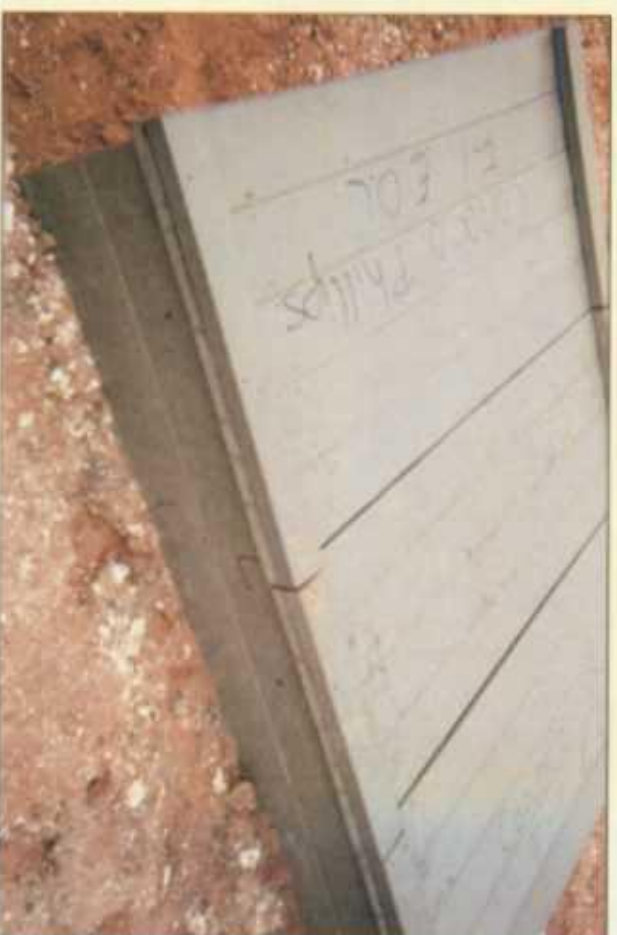
Completed new junction box 45 ft southwest of old one