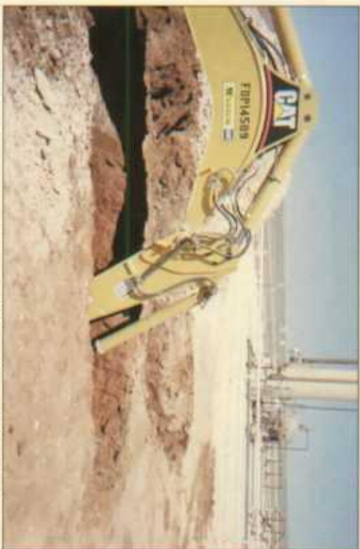
Beginning excavation & delineation 3/17/2004