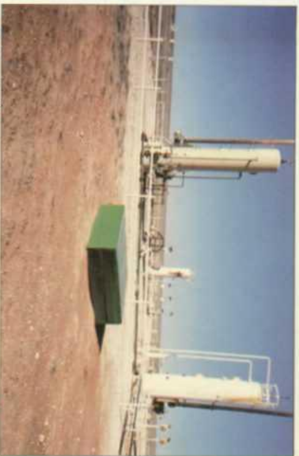
Undisturbed junction box prior to excavation