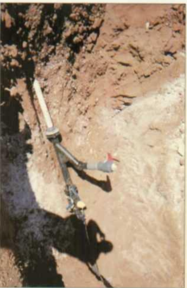
New plumbing at new box site 45 ft southwest