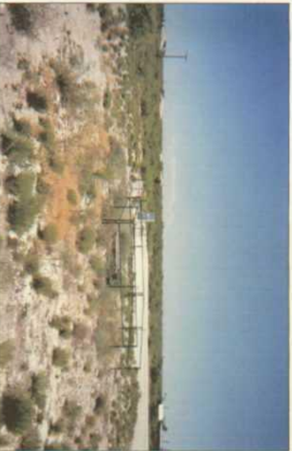
undisturbed junction box