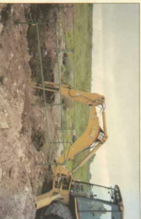
delineation & excavation