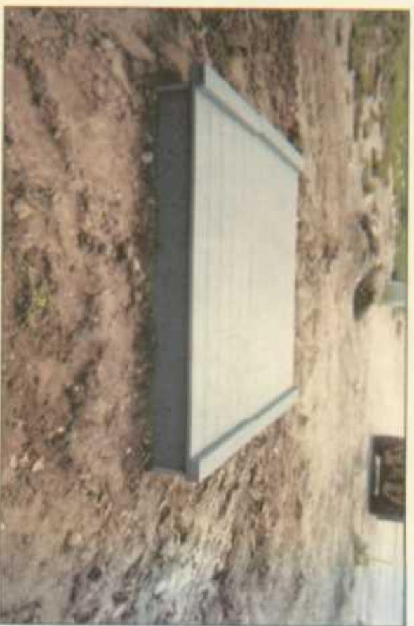
completed watertight junction box