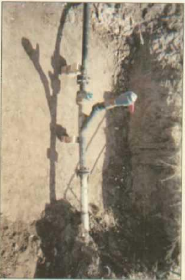
compacted floor ready for box