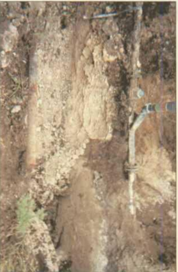
delineation & excavation