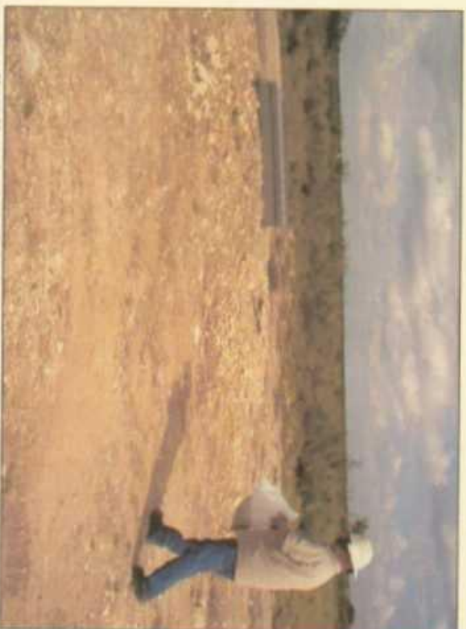
seeding disturbed surface