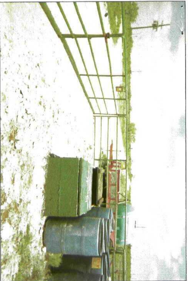
undisturbed junction box