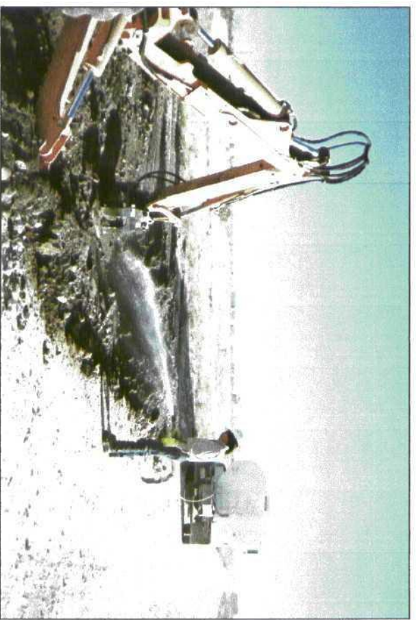
backfilling and compacting