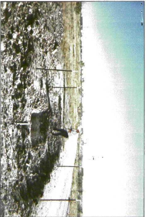
delineation trench before backfilling