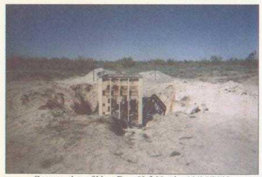
Construction of New Box 60 ft North 10/16/2003