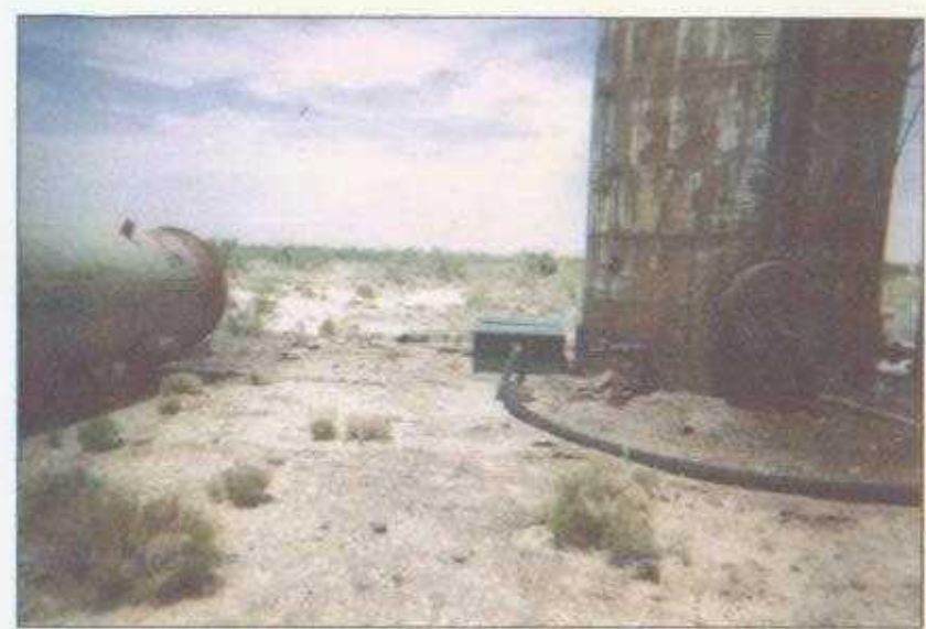
Undisturbed Junction Box Before NORM Removal 8/6/2003