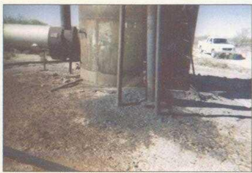
Close-up of East Side of Tank Adjacent to Junction Box