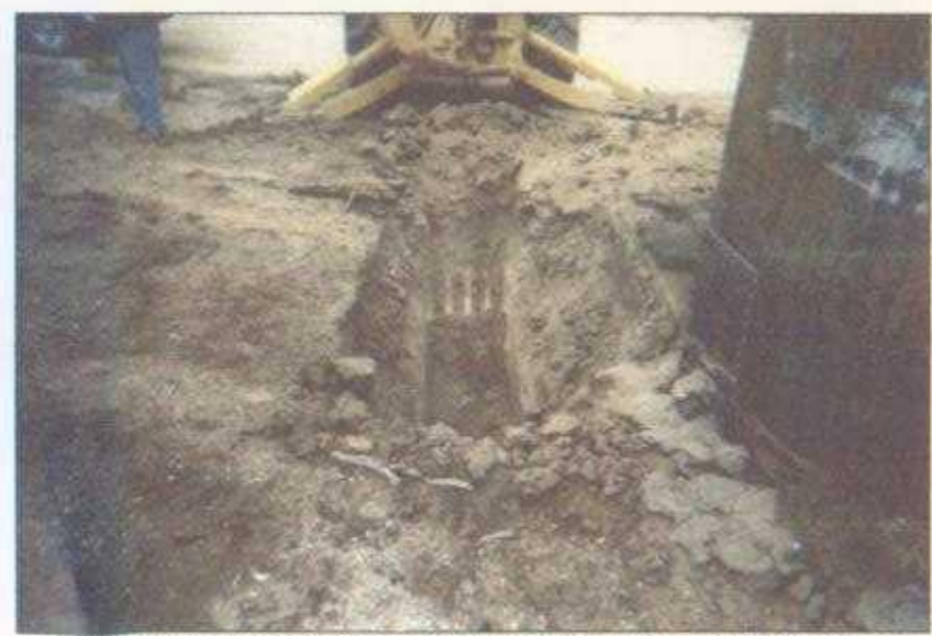
Vertical Excavation At Old Junction Box 11/7/2003