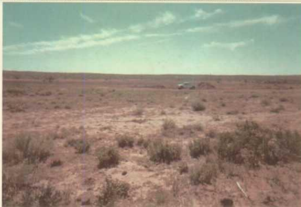
2. Photograph taken before remedial action, facing south.