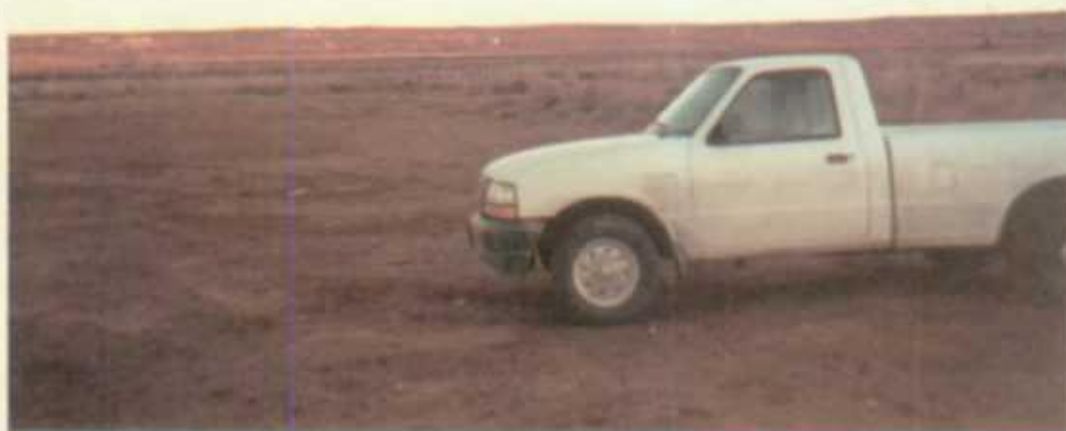
9. Looking east after remedial action.