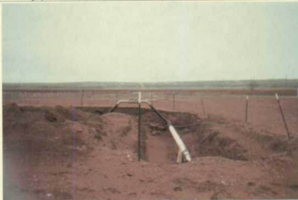
4. Photograph taken before remedial action, facing east.