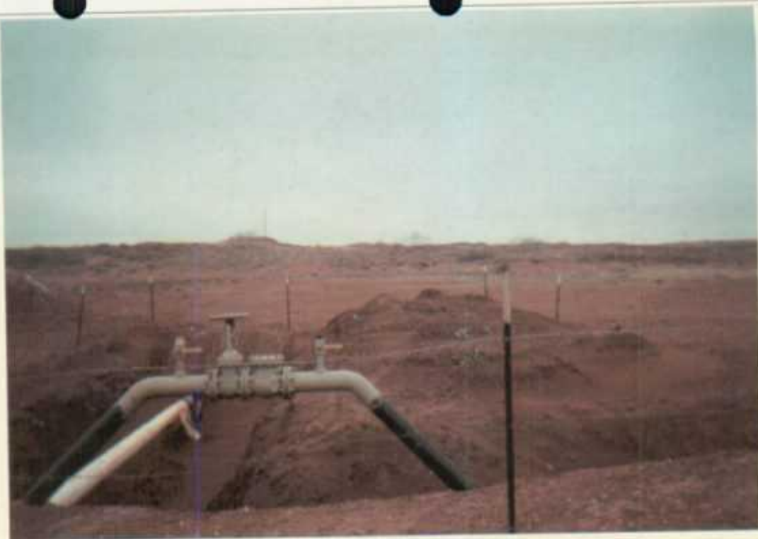
5. Photograph taken before remedial action, facing west.