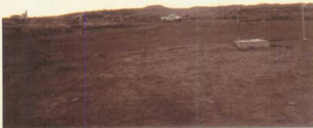
7. Looking west after remedial action.