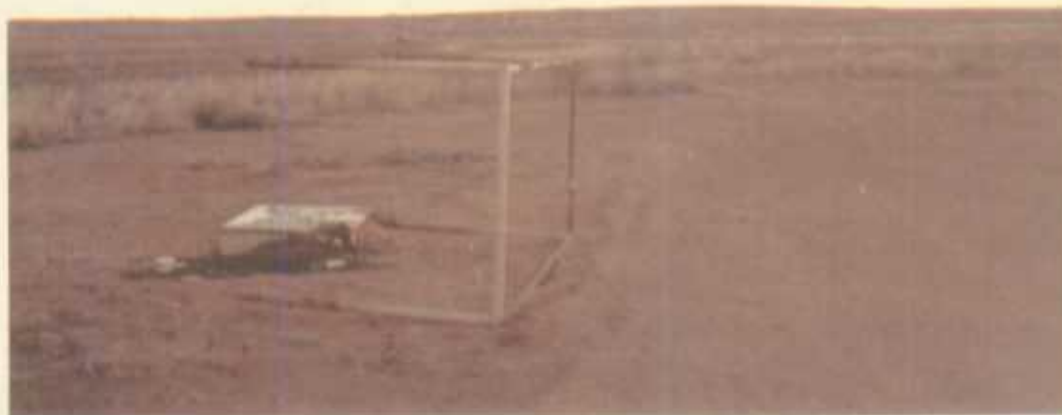
8. Looking northeast after remedial action.