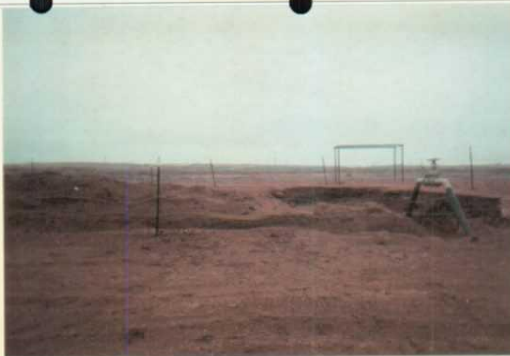
3. Photograph taken before remedial action, facing north.