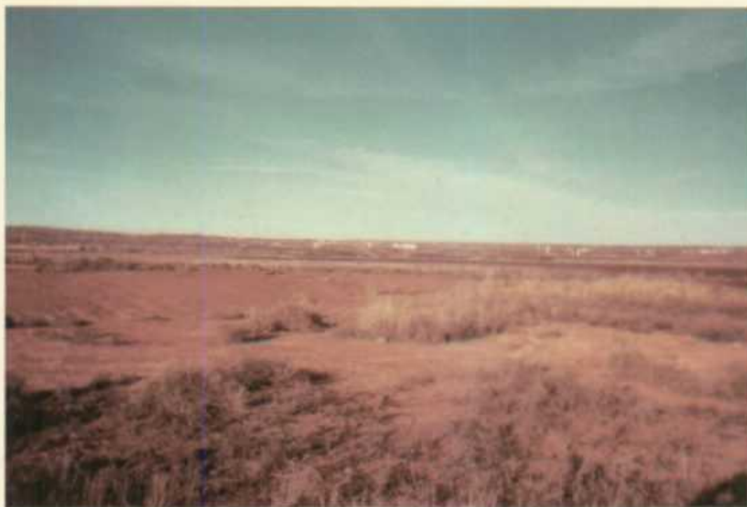
10. Looking northeast after remedial action.