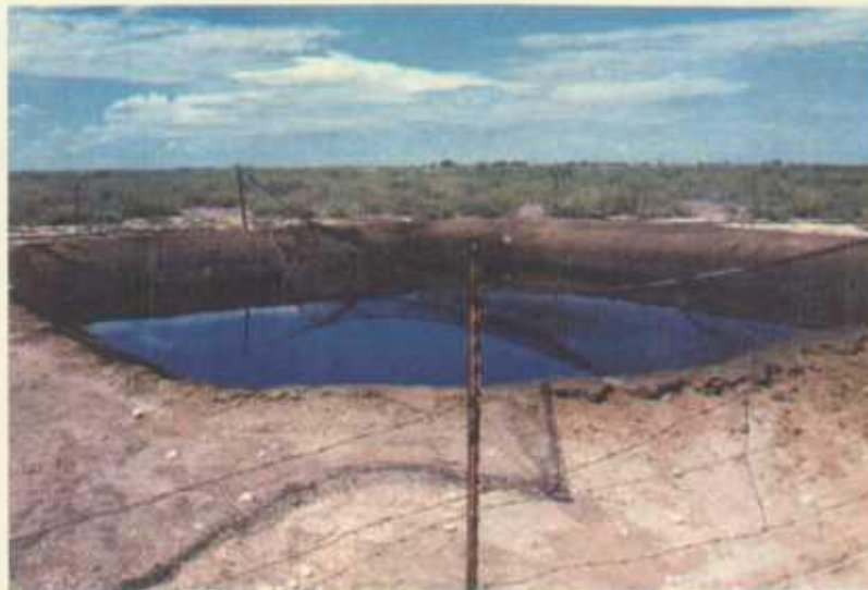
Photo 1: Lattion Tank Battery unlined disposal pit prior to Yates' acquisition of the site.

In 1997, Yates purchased production facilities, including the Lattion Tank Battery, from H&S Oil Company (H&S). H&S was a small, privately operated oil and gas producer that did not maintain an effective environmental management or compliance program. Since purchasing the facilities, Yates has made a considerable investment of both time and financial resources which has resulted in significant improvements to the environmental condition at the Site. The following photographs show the condition prior to and following Yates' acquisition of the Site.