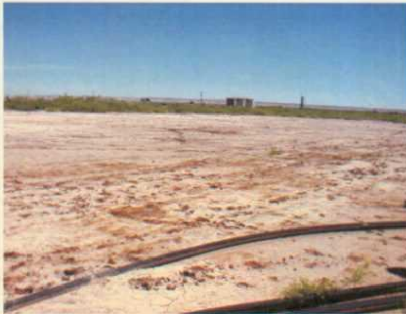
Photo 2: Lattion Tank Battery pit location following acquisition and closure by Yates.

Harding ESE (formerly Harding Lawson Associates [HLA]) performed a site reconnaissance at the Lattion Tank Battery on September 23, 1997, as part of an Environmental Site Assessment (ESA) for the H&S Oil and Gas properties prior to their acquisition by Yates. This acquisition included the Site. At the time of the field inspection, the Lattion disposal pit was approximately 40 feet by 40 feet in area and contained water and oil with petroleum saturated soils in the pit walls. Harding ESE collected a sample of the pit water/oil interface for laboratory analyses to determine the petroleum hydrocarbon and benzene, toluene, ethylbenzene, and total xylenes (BTEX) concentrations. The oil at the surface contained 180,000 parts per million (ppm) of total petroleum hydrocarbons (TPH), exceeding the OCD Soil Guideline of 1,000 ppm. The water beneath the oil in the pit contained 20 parts per billion (ppb) of benzene, exceeding the New Mexico Water Quality Control Commission (WQCC) water standard of 10 ppb. Harding ESE recommended at that time that contaminated soils should be removed or remediated on-site, and the unlined disposal pit should be closed in accordance with OCD guidelines.