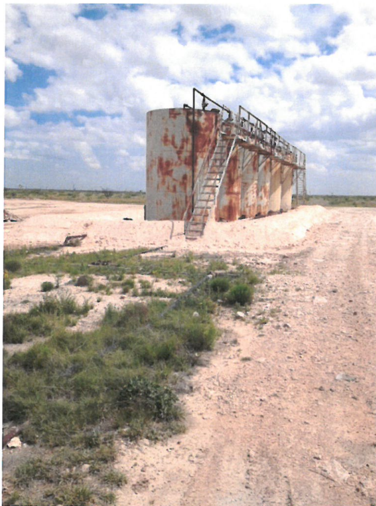
Roadway adjacent to tank battery after clean-up