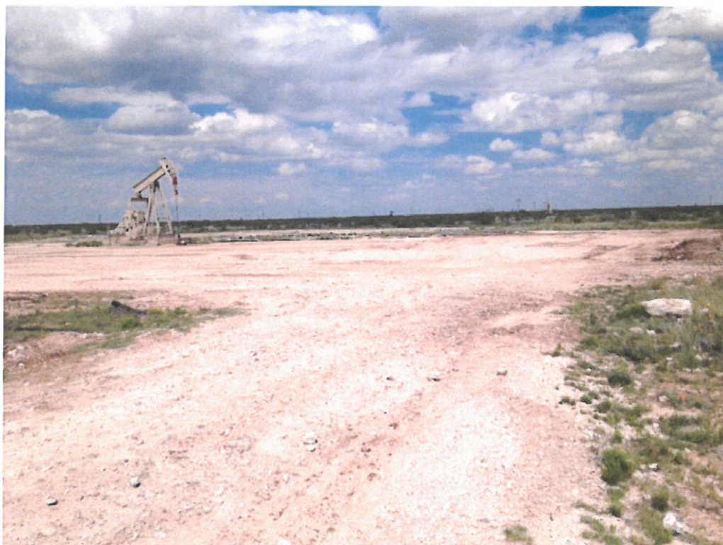
Roadway towards well Shahara #9, moving away from tank battery.