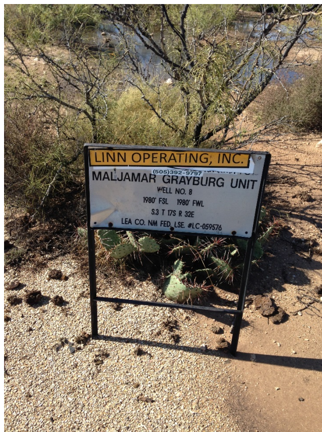
Lease sign marking location