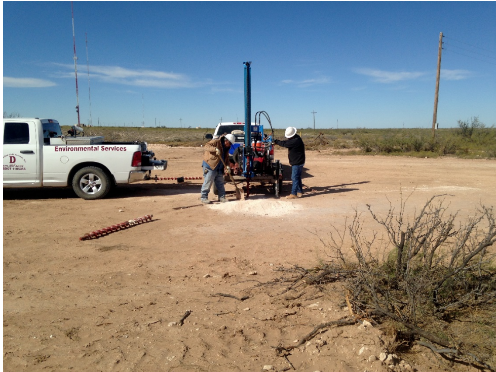
Using drill for confirmation samples