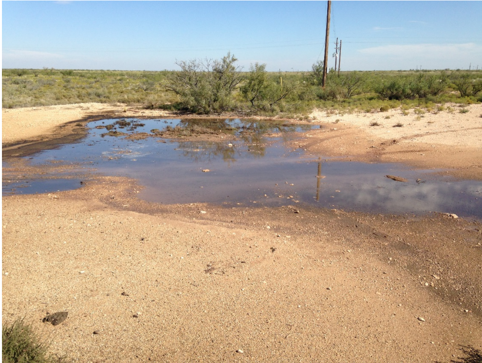
Spill area on pad