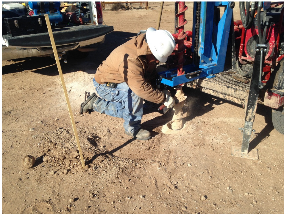
Obtaining samples from drilling