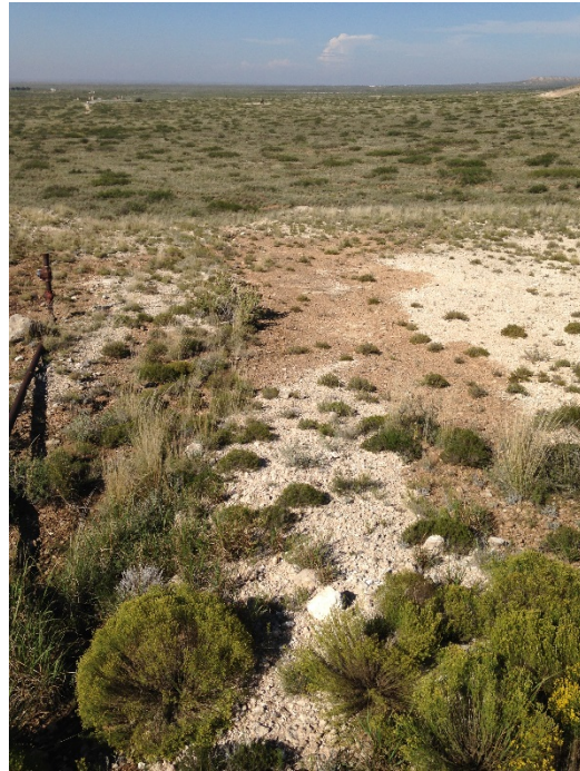
Spill area on slope of Caprock Escarpment