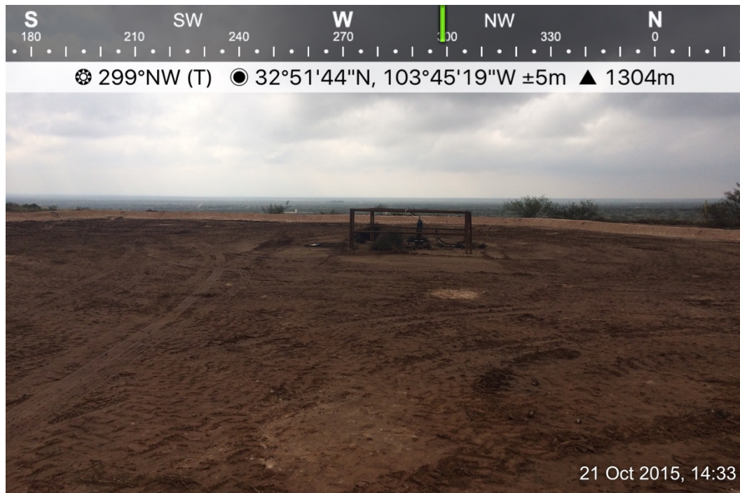
Spill area on pad after initial scrape