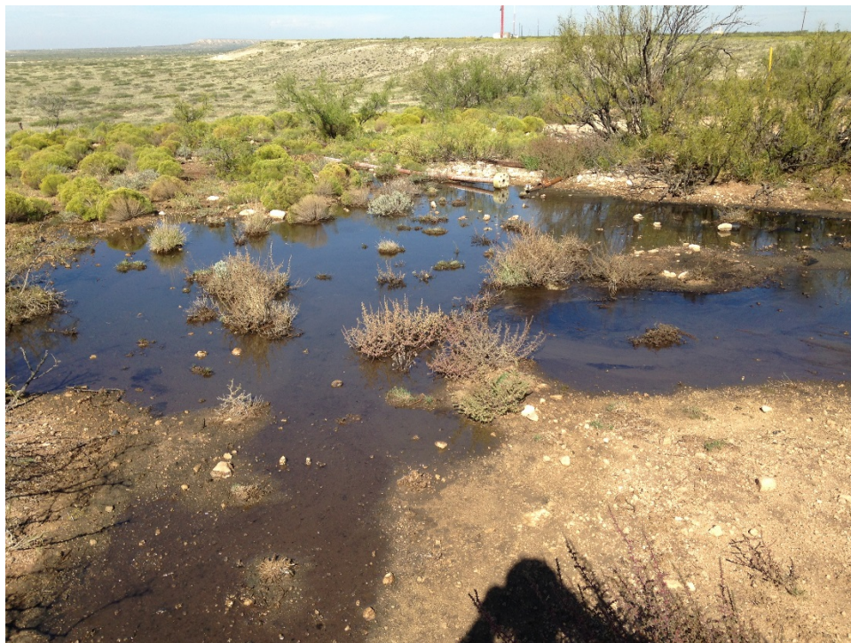
Spill area on pad/pasture