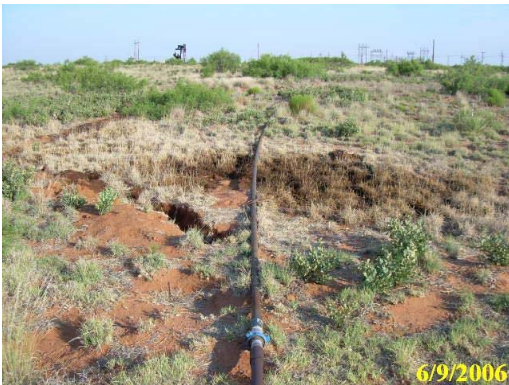
Photo #1 – Looking northeasterly across point of release and overspray area