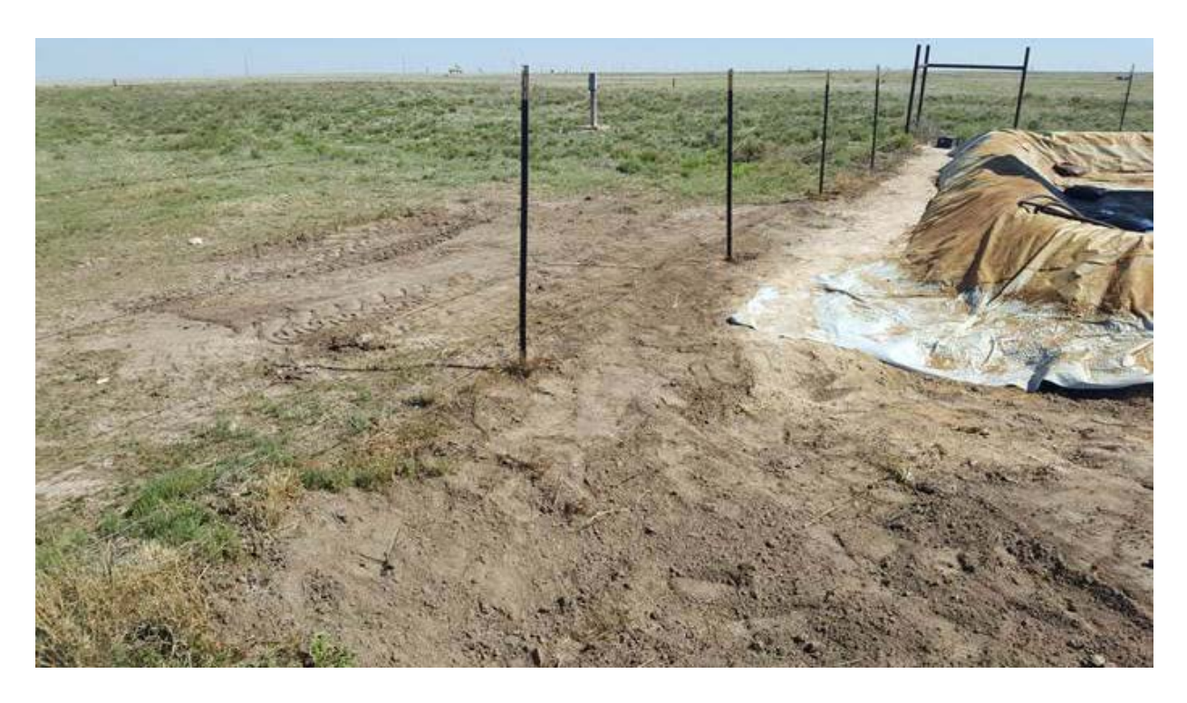
Facing SE: Stained soil scraped near NE corner of AST firewall and outside fenced area