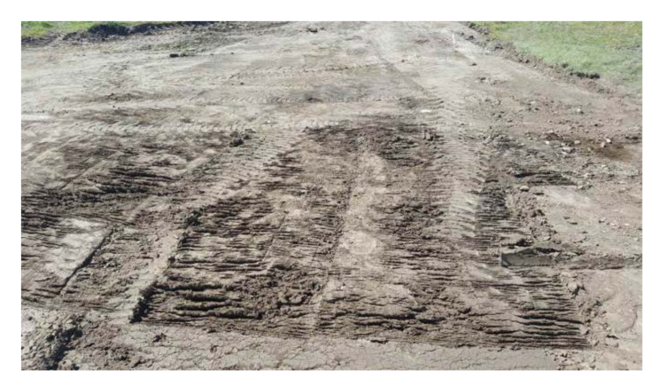
Facing North: Impacted soil scraped from release area