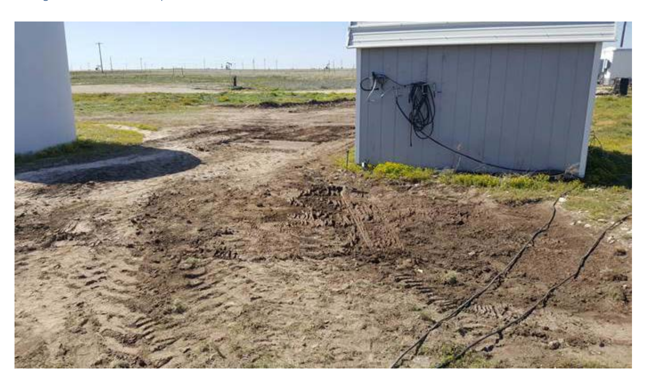
Facing NW: Impacted soil scraped from release area