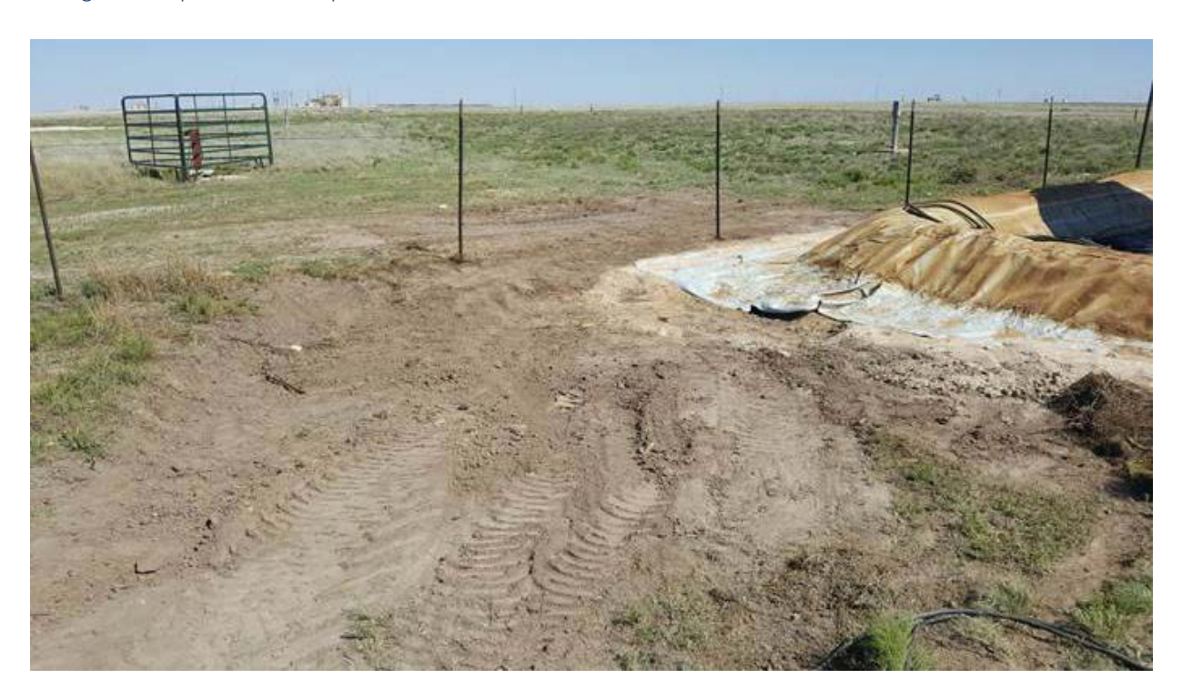
Facing ESE: Stained soil scraped along AST's north firewall