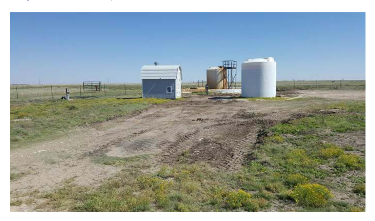
Facing South: Impacted soil scraped from northern boundary of release area