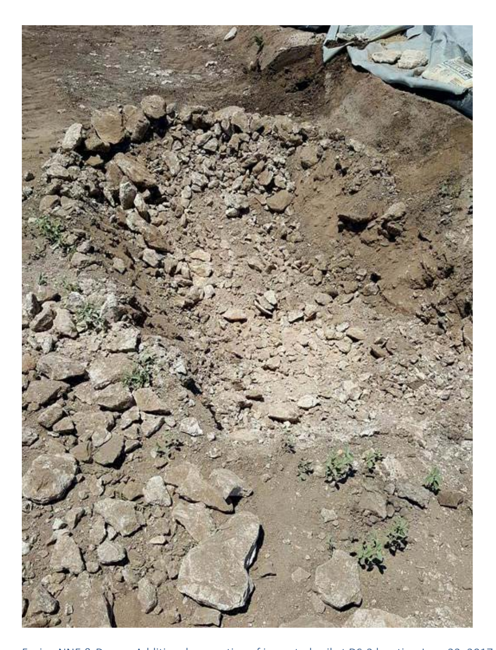
Facing NNE & Down: Additional excavating of impacted soil at DS-3 location June 22, 2017. Confirmation sample was collected at bottom from 20-24".

After review, please contact me if you have further questions, comments, or concerns.