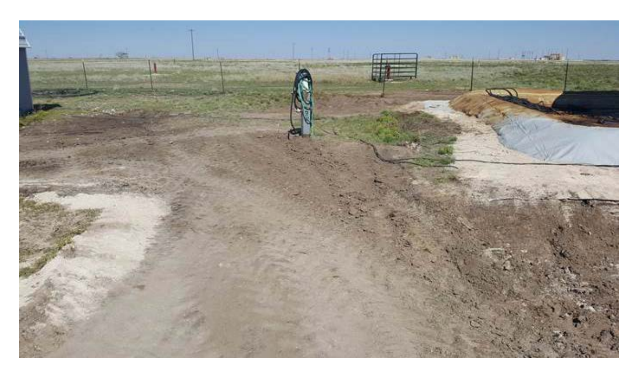
Facing ENE: Impacted soil scraped near NW corner of AST firewall