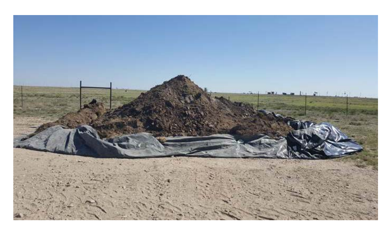
Facing South: Approximately 50-60 yards of impacted soil removed from release are