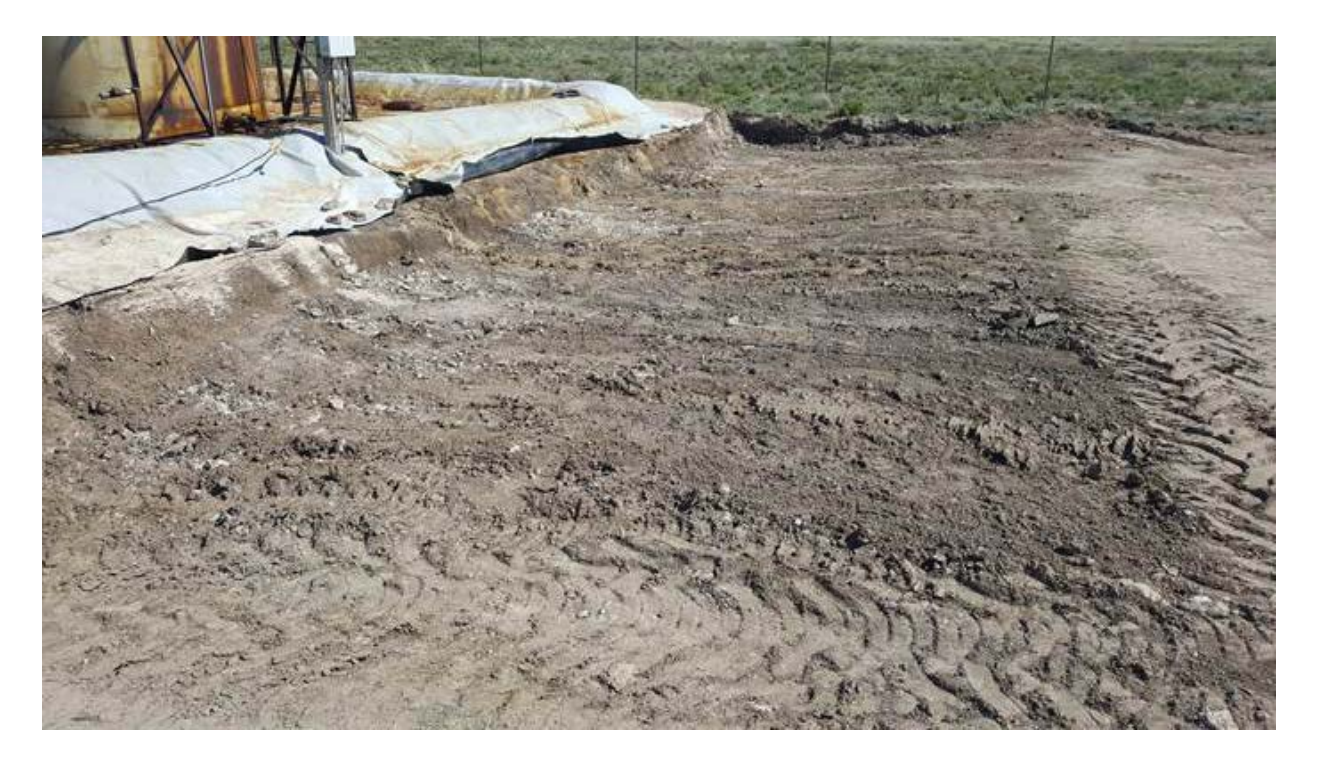
Facing South: Impacted soil scraped along western edge of AST firewall

Per our recent phone conversation, below are photos of the release area with impacted soil removed and photos of additional excavating of soil from DS-3 & DS-7 locations