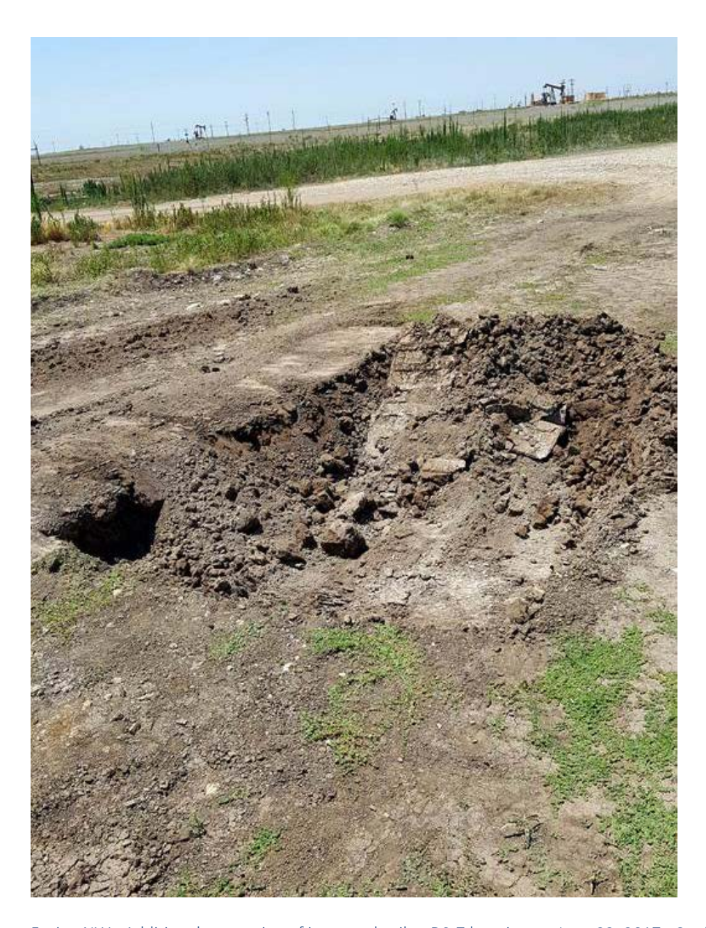
Facing NW: Additional excavating of impacted soil at DS-7 location on June 22, 2017. Confirmation sample was collected at bottom from 10-16"