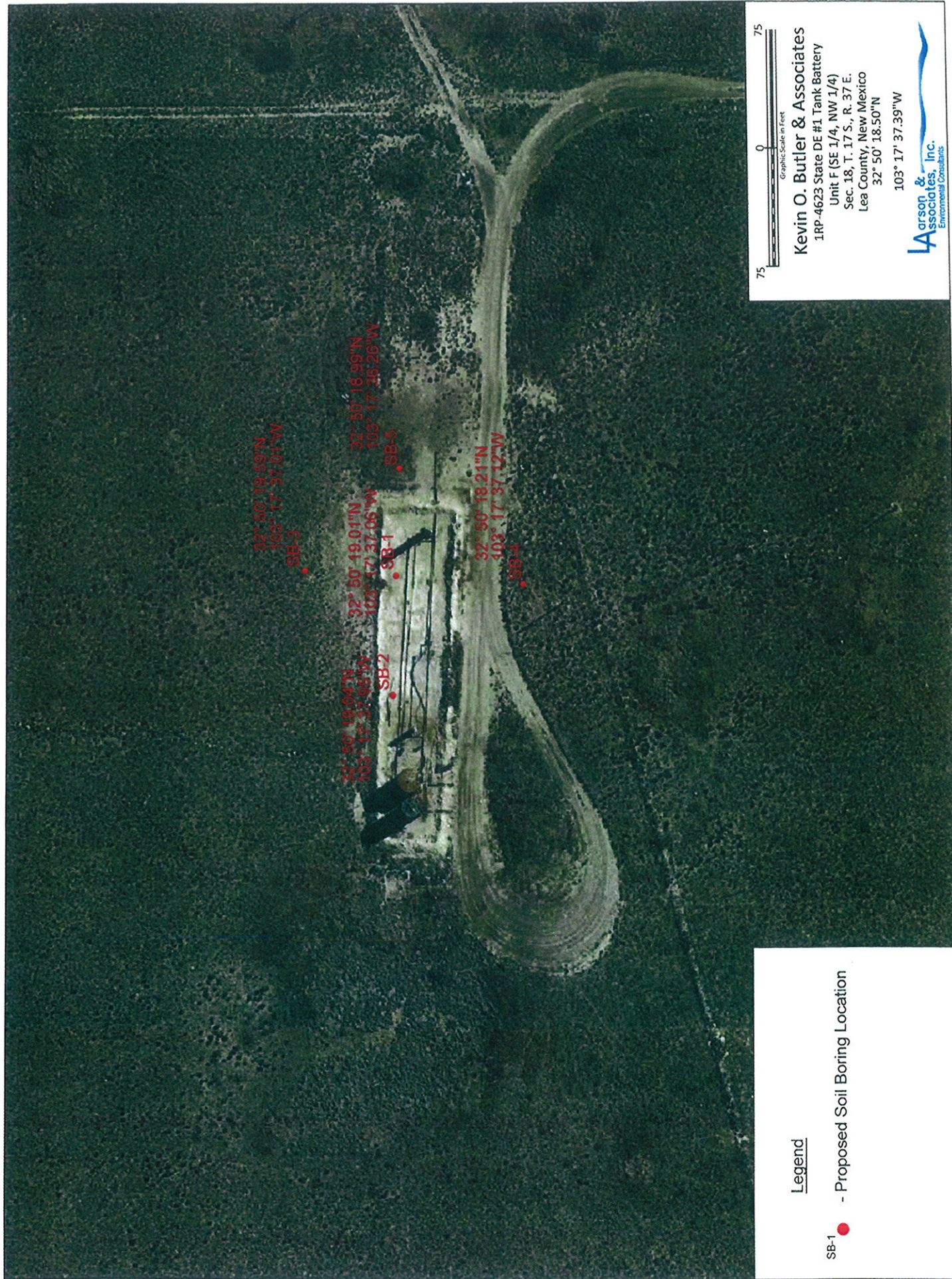
Figure 2 - Aerial Map