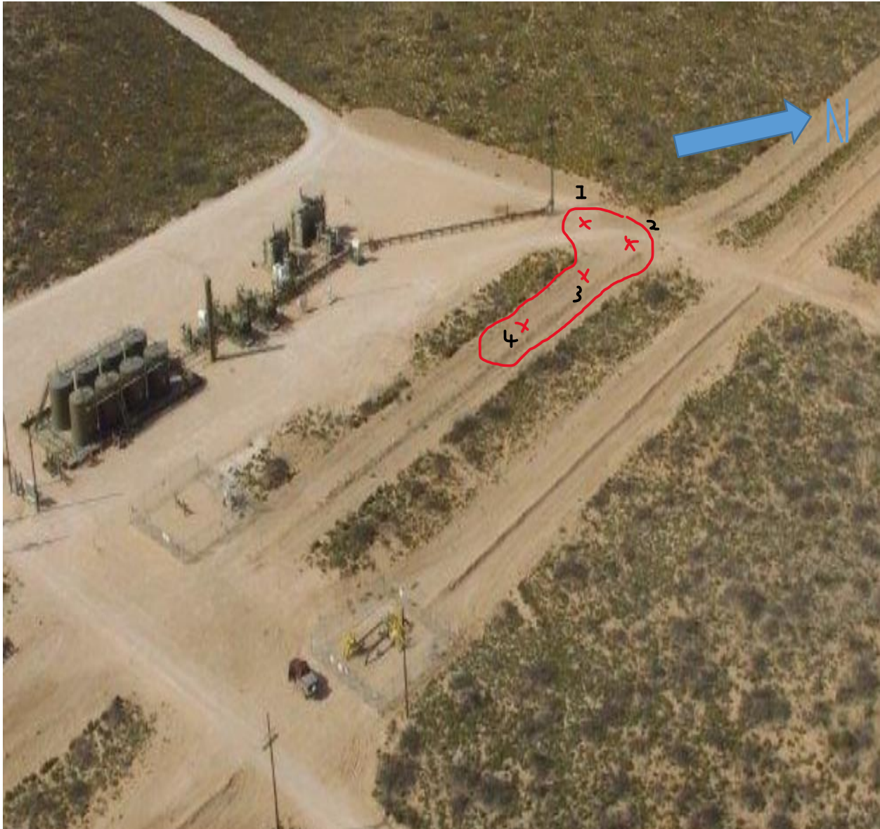
Figure 1 – Site Map