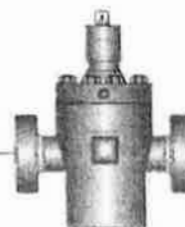
4" Manual Valve