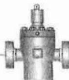
2" Manual Valve