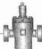
2" Manual Valve