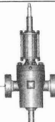
4" Hydraulic Valve