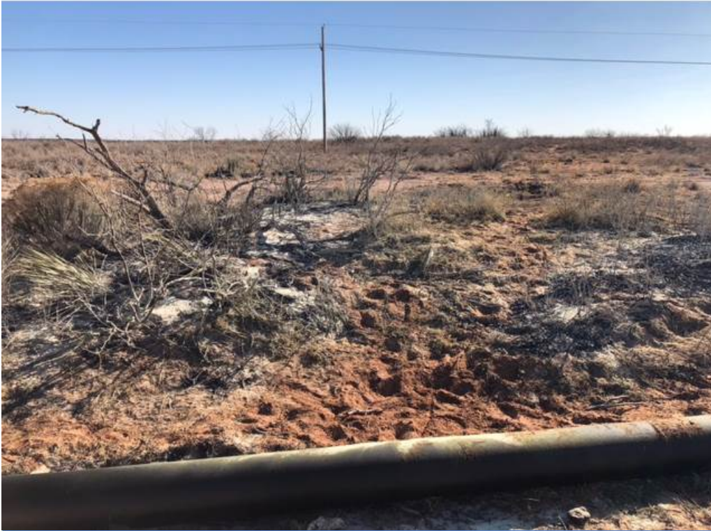
Extent of release