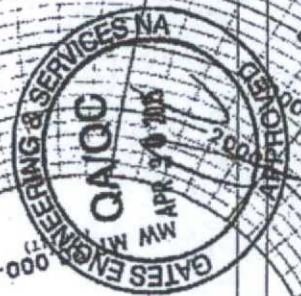
CHART POOL USA INC. PORTAGE, INDIANA

ROSE I.D. 3\frac{1}{2} " LENGTH 48" GRADE 10K TEST PRESSURE 15000 P.S.I. TEST DATE 4-20-55 TEST TIME 22:50 WORKING PRESSURE 10000 ASSEMBLY DATE 4-20-55 END 12:15 END 12:15 10000 12000 14000 16000 18000 10000 12000 14000 16000 18000