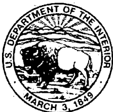
EXHIBIT NO. 1

Bureau of Land Management, Carlsbad Field Office 620 E. Greene Street Carlsbad, NM 88220