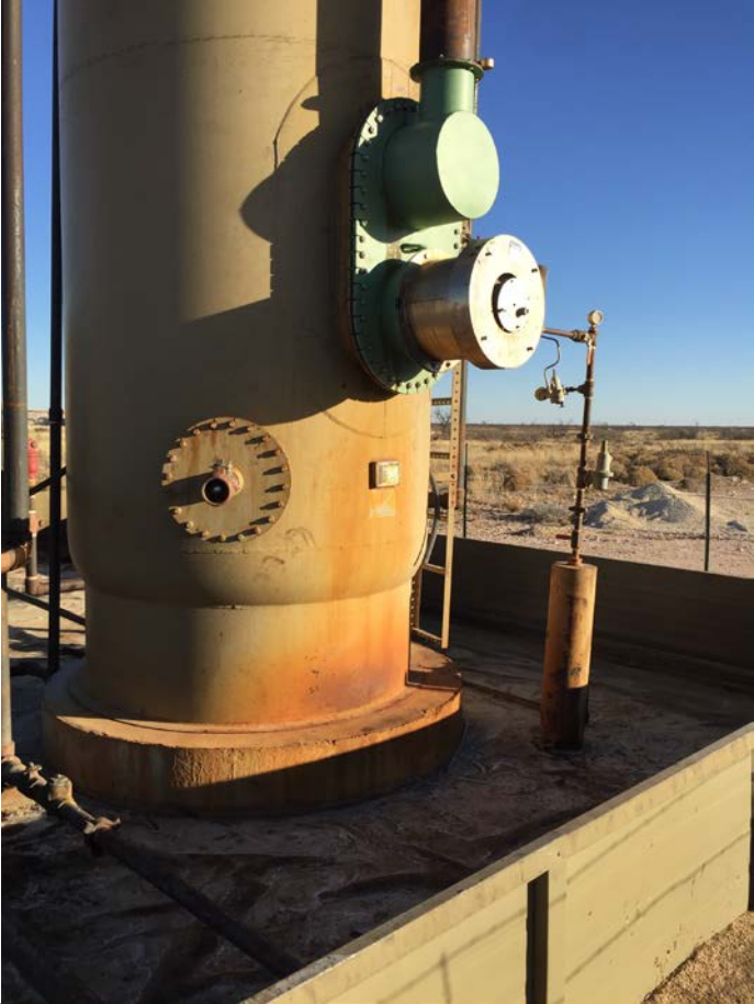
Post Clean-up Activities