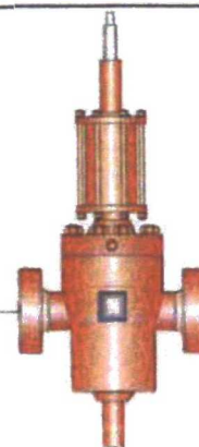
4" Hydraulic Valve