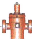
2" Manual Valve