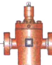
4" Manual Valve