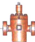
2" Manual Valve