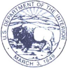
EXHIBIT NO. 1

Automatic shut off, check valves, or similar systems will be installed for pipelines and tanks to minimize the effects of catastrophic line failures used in production or drilling.