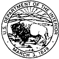
EXHIBIT NO. 1

Automatic shut off, check valves, or similar systems will be installed for pipelines and tanks to minimize the effects of catastrophic line failures used in production or drilling.