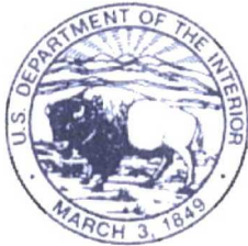
EXHIBIT NO. 1

Automatic shut off, check valves, or similar systems will be installed for pipelines and tanks to minimize the effects of catastrophic line failures used in production or drilling.