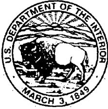
EXHIBIT NO. 1