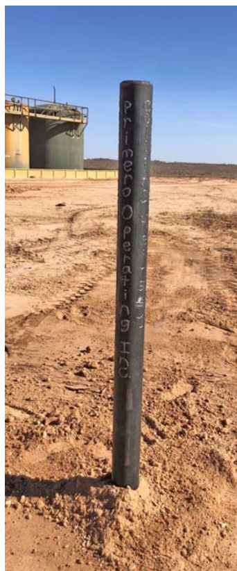
Dry Hole Marker Installed