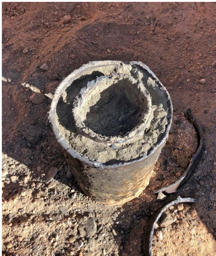
Wellhead Cut off, cement to Surface both strings

Attachement to C-103 Subsequent Report of Plugging Collins Heirs #1 API#30-025-40178