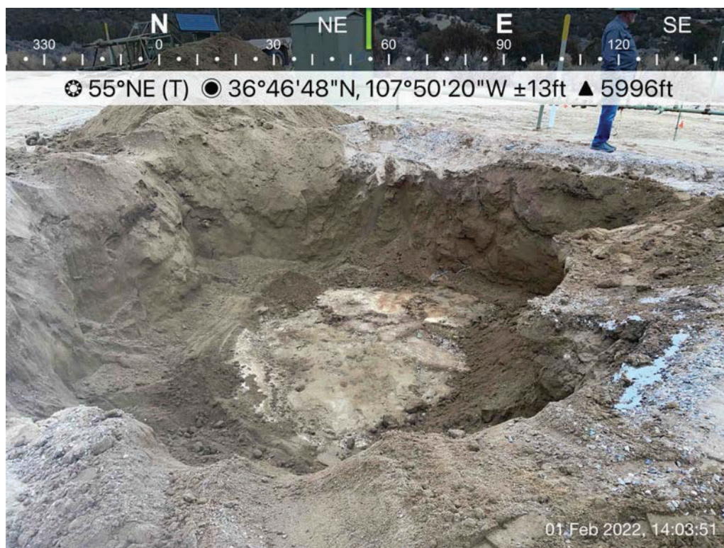
Photo 3: Former location of 95 bbls steel tank "A" following removal, 2/1/2022.