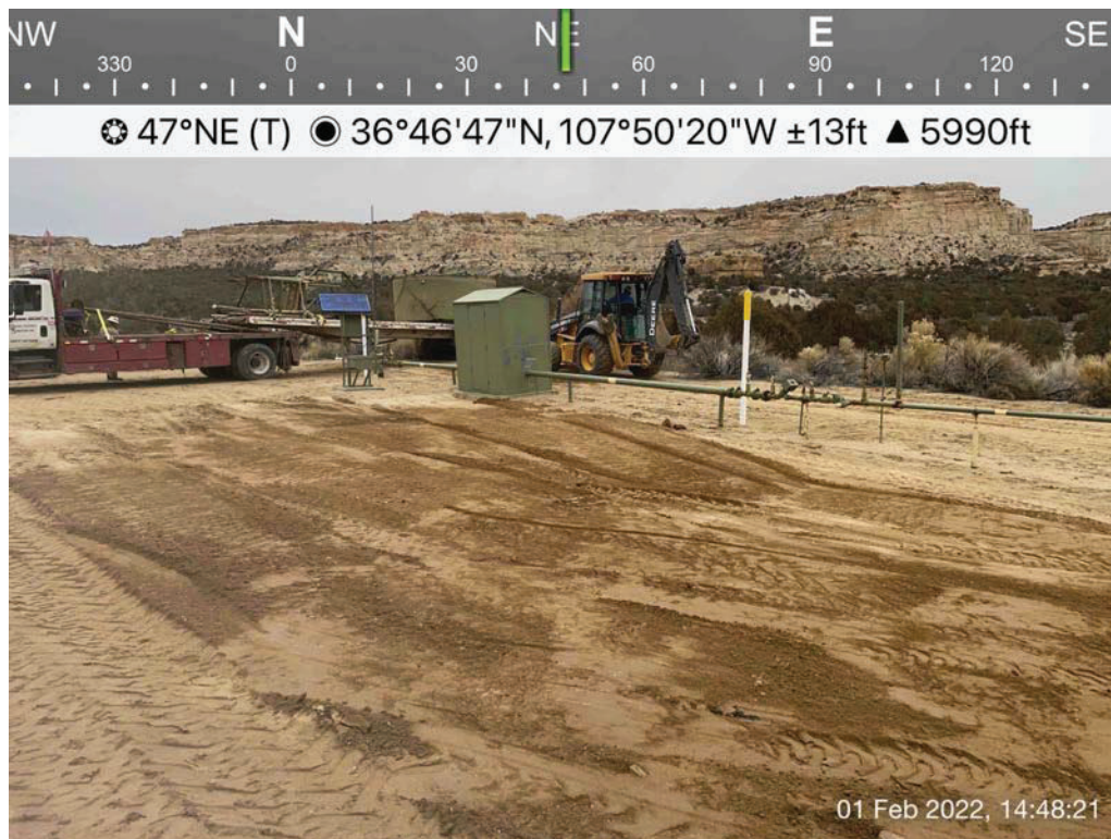
Photo 4: Former location of 95 bbls steel tank "A" following removal and re-grading, 2/1/2022.