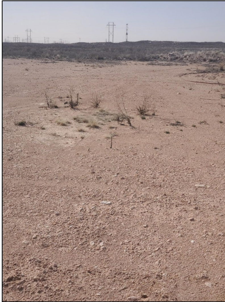
Photo 3: View west of closed-loop tank location, no staining observed