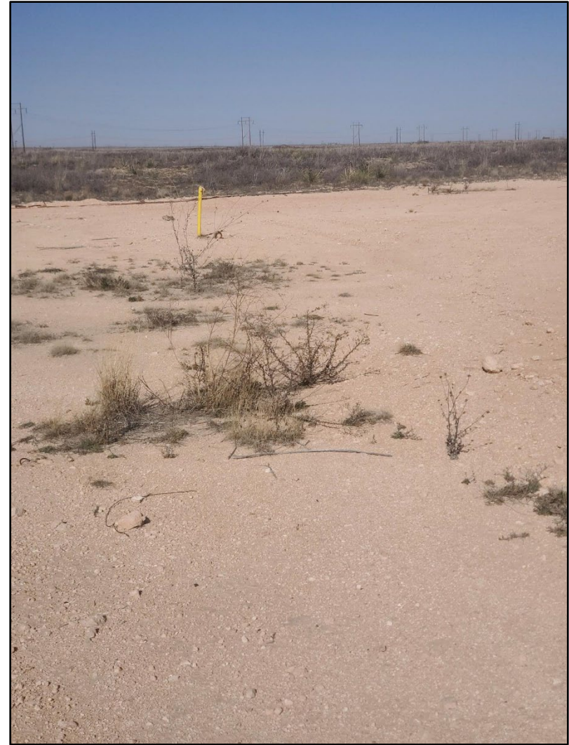
Photo 2: View northeast of closed-loop tank location, no staining observed