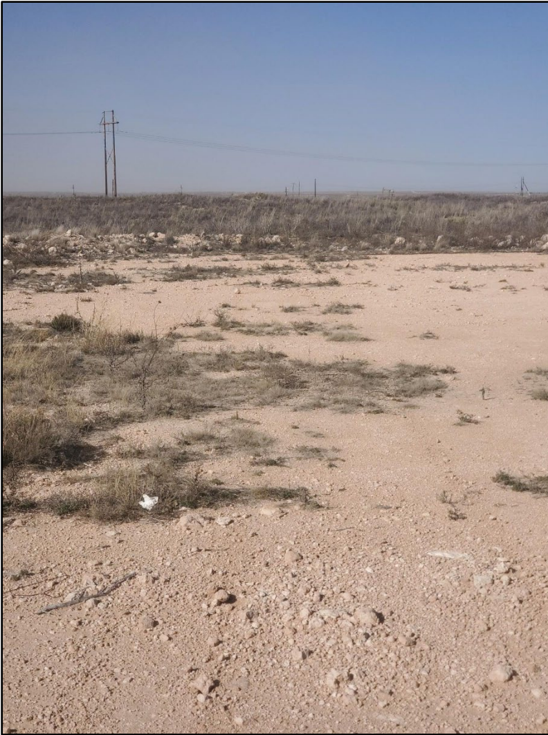
Photo 1: View north of closed-loop tank location, no staining observed