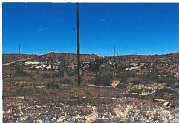
Photograph 3 Description: Power pole and production equipment View: West