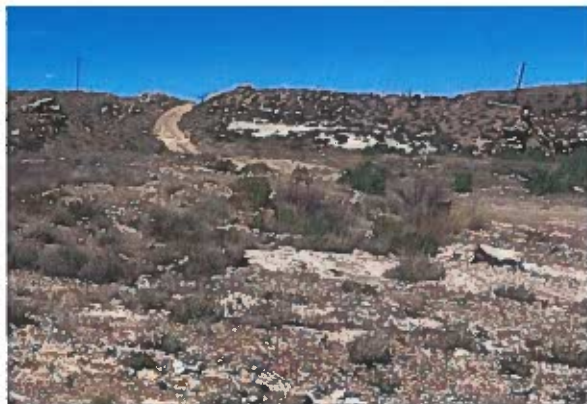
Photograph 1 Description: Access road View: West

Photographic Log Marathon Petroleum Company LP NE HOGBACK UNIT #039 30-045-09656