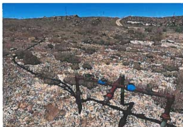
Photograph 4 Description: Production equipment View: West