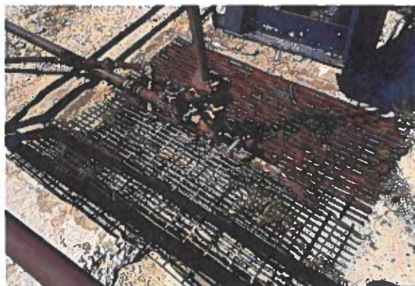
Photograph 2 Description: Well head cellar View: NA