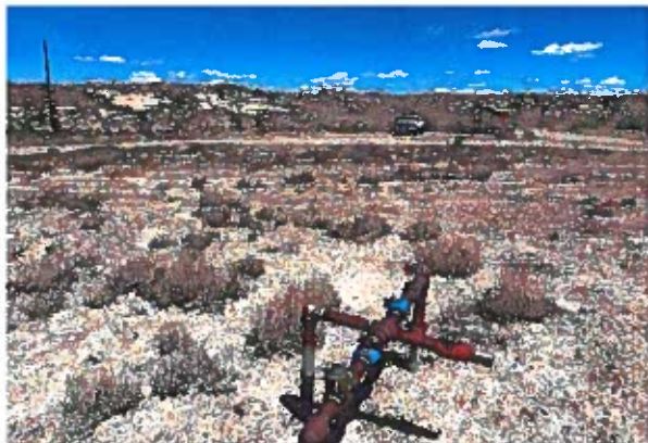
Photograph 5 Date: 5-6-2024 Description: Well pad and surrounding land View: North