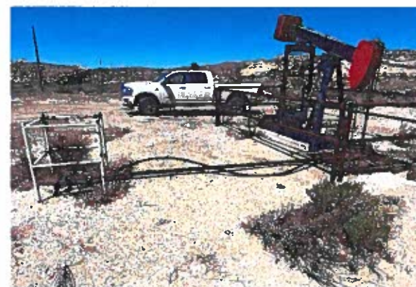
Photograph 8 Date: 5-6-2024 Description: Production equipment View: West