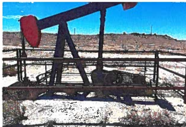
Photograph 6 Date: 5-6-2024 Description: Production equipment View: South