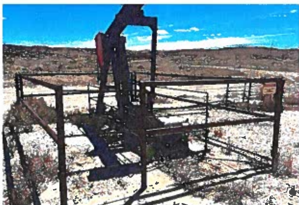
Photograph 7 Date: 5-6-2024 Description: Production equipment View: East