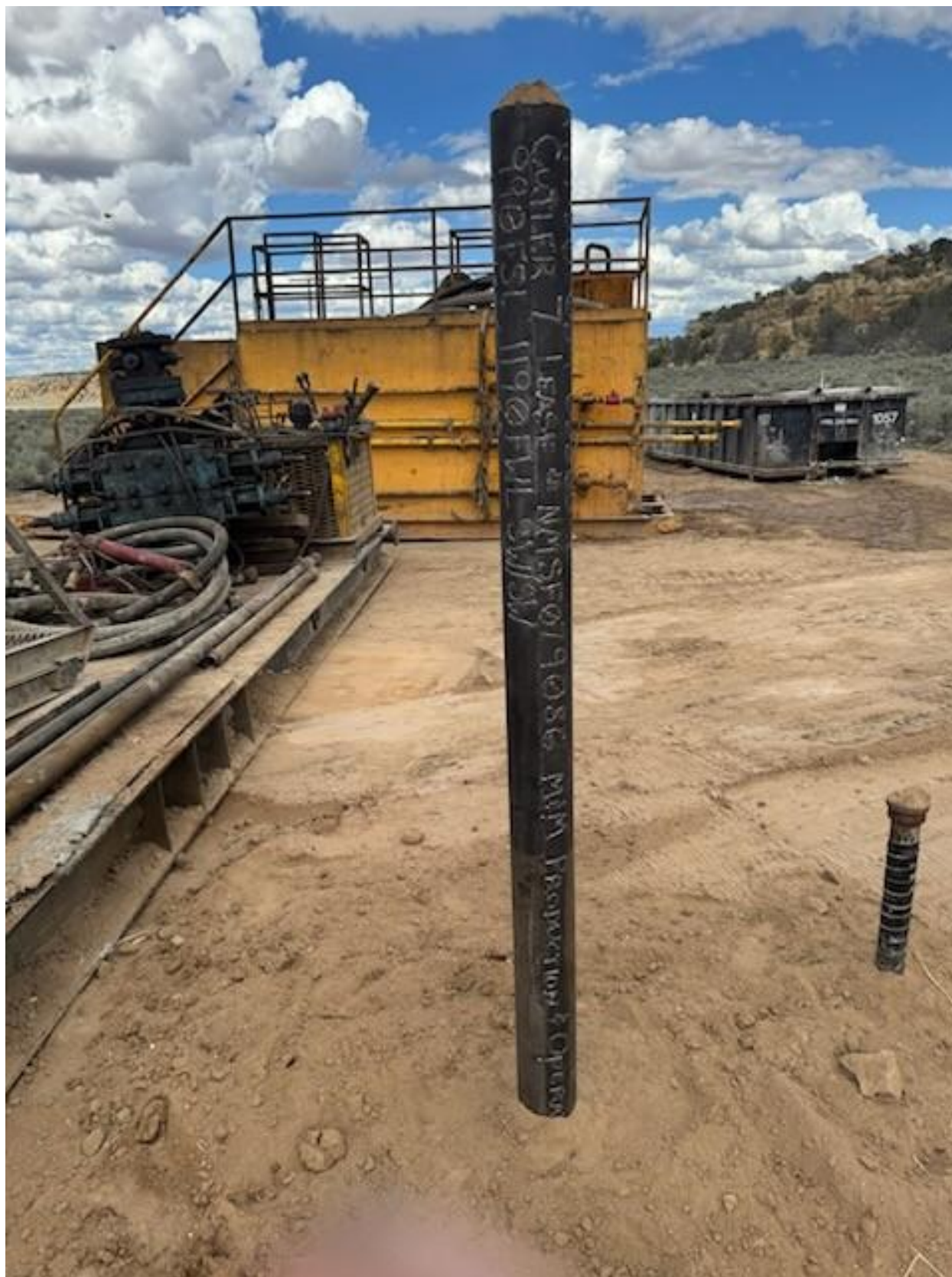
Figure 5: Marker III