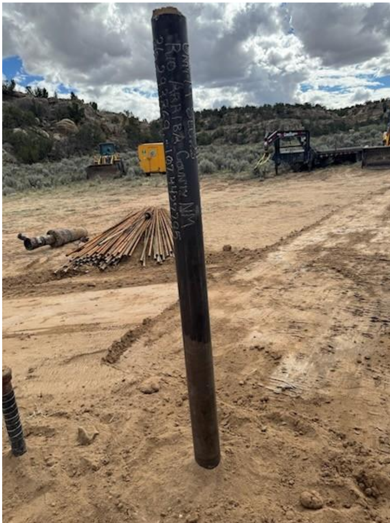
Released to Imaging: 11/7/2025 9:38:32 AM