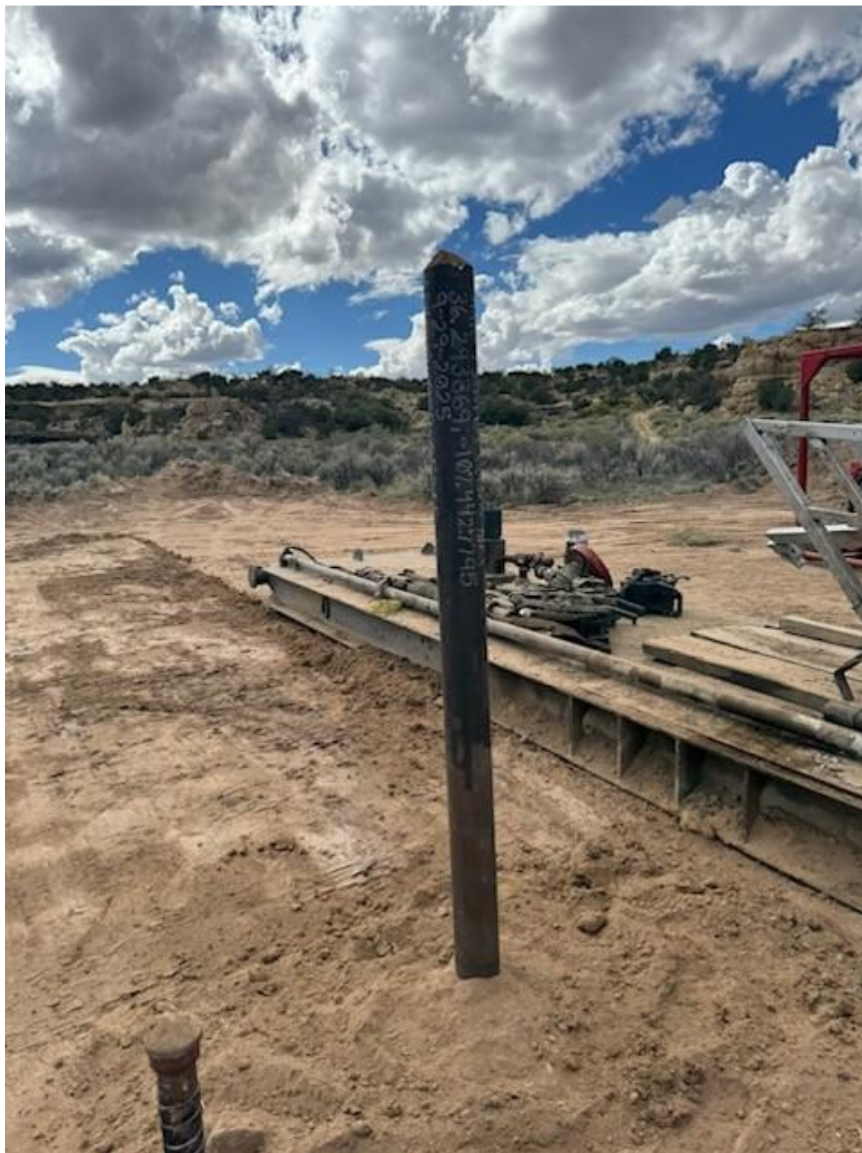
Figure 3: Marker