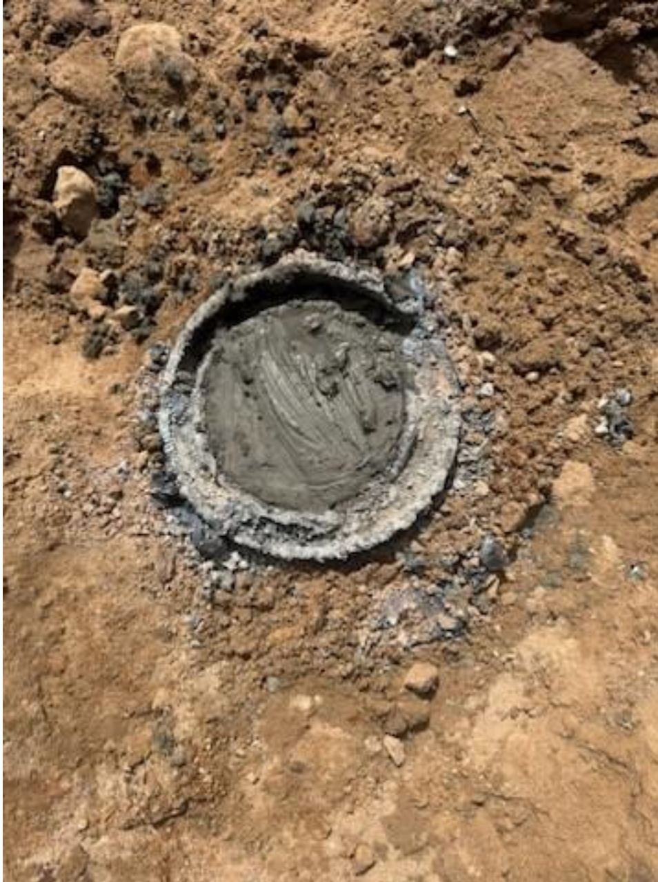
Figure 1: Cut Off