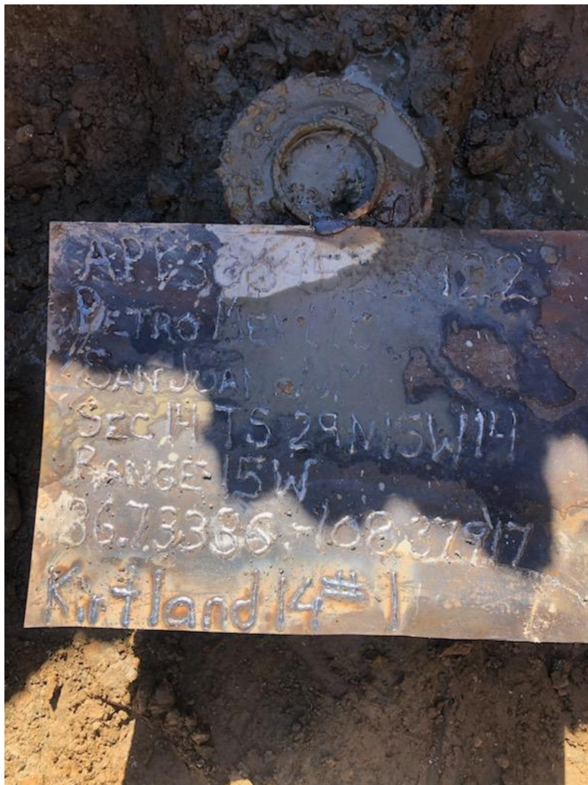
Figure 3: Marker