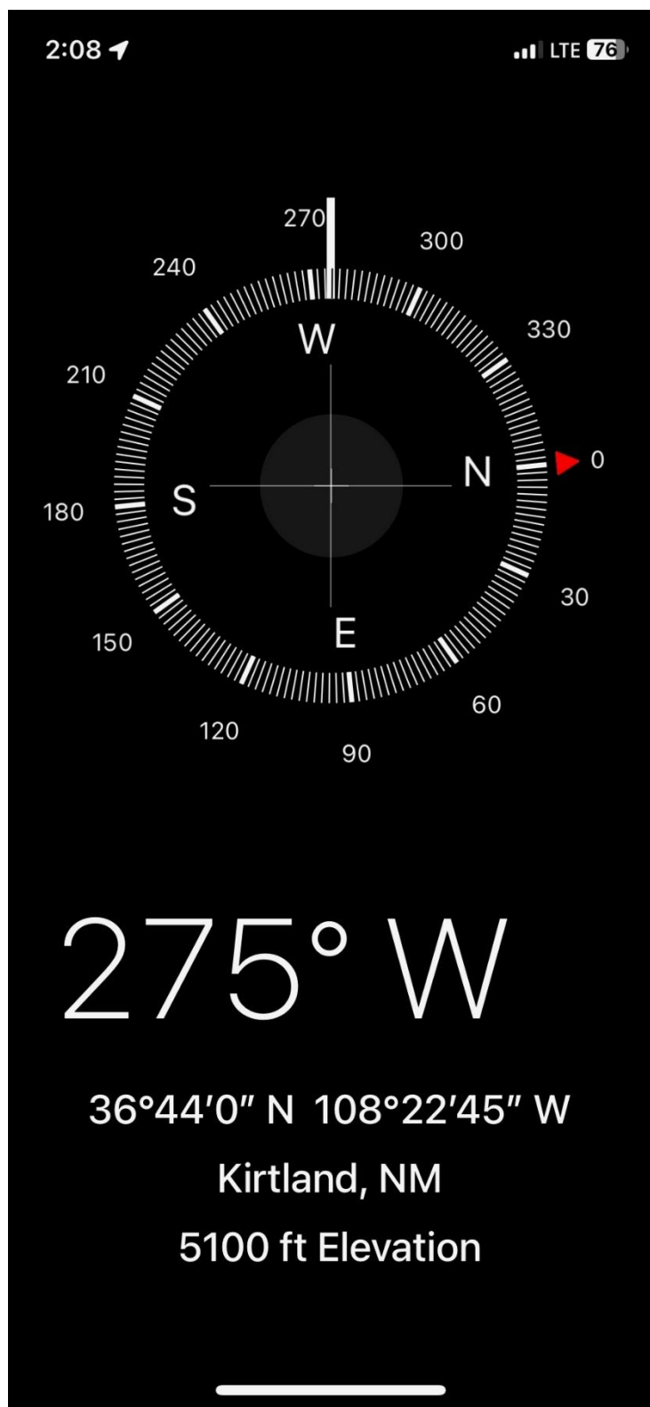
Figure 2: GPS