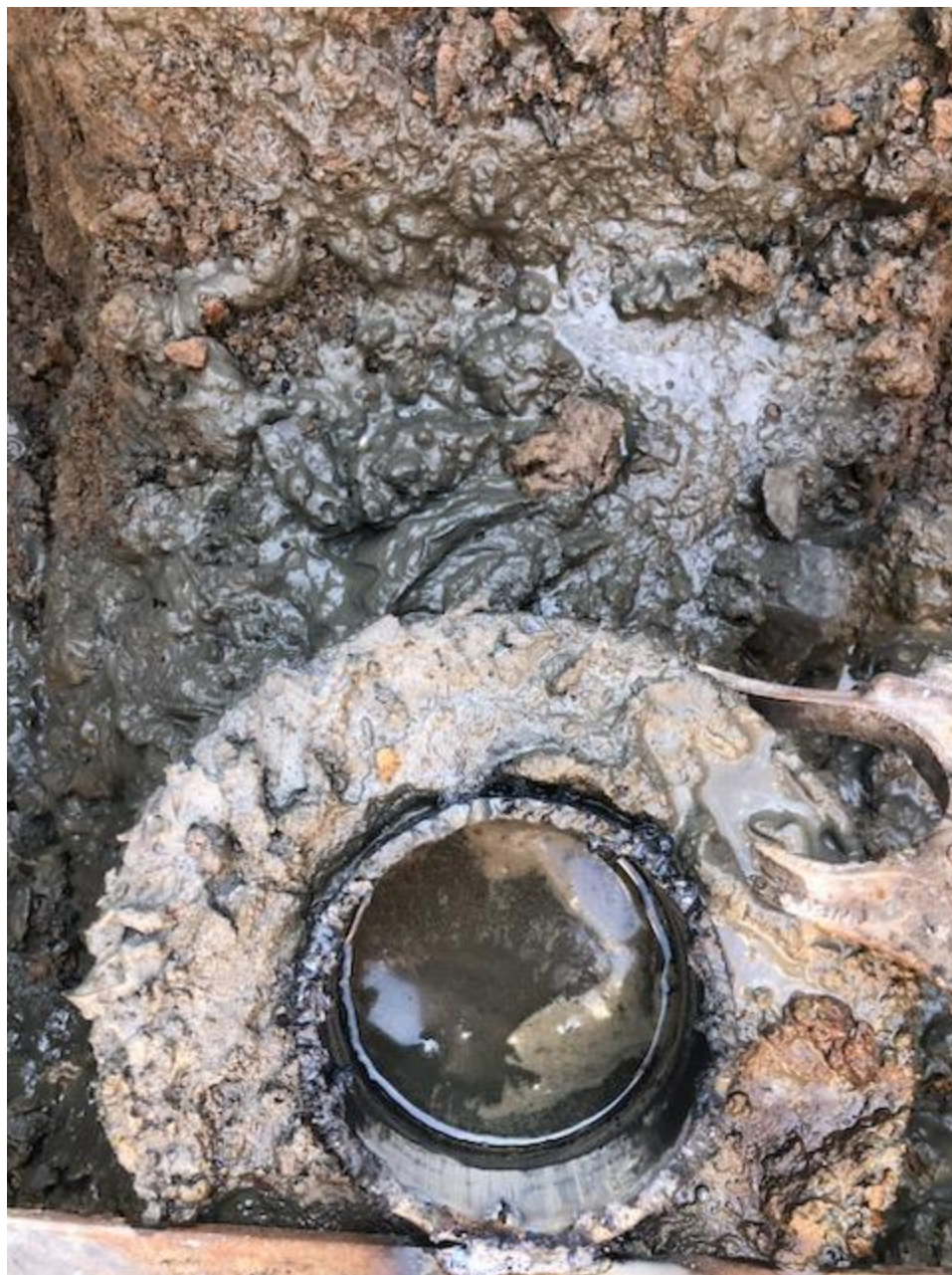
Figure 1: Cut Off