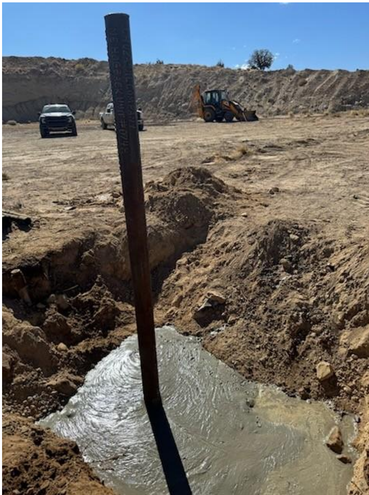
Figure 2: Top Off