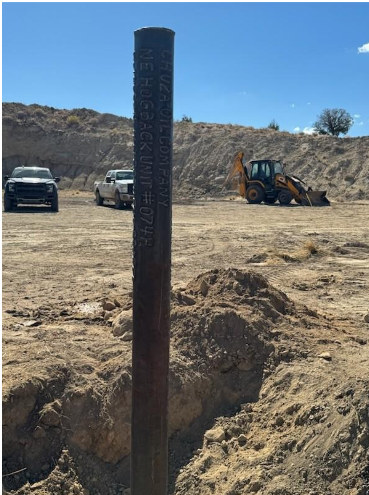
Figure 1: Marker