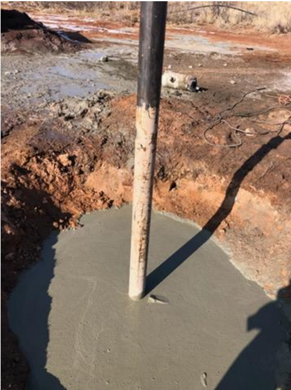
Figure 5: Marker II