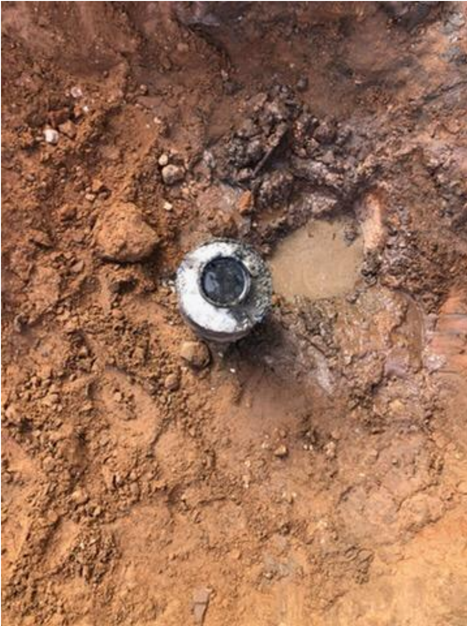
Figure 1: Cut Off