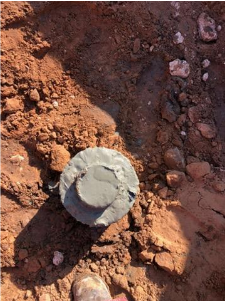
Figure 3: Top Off