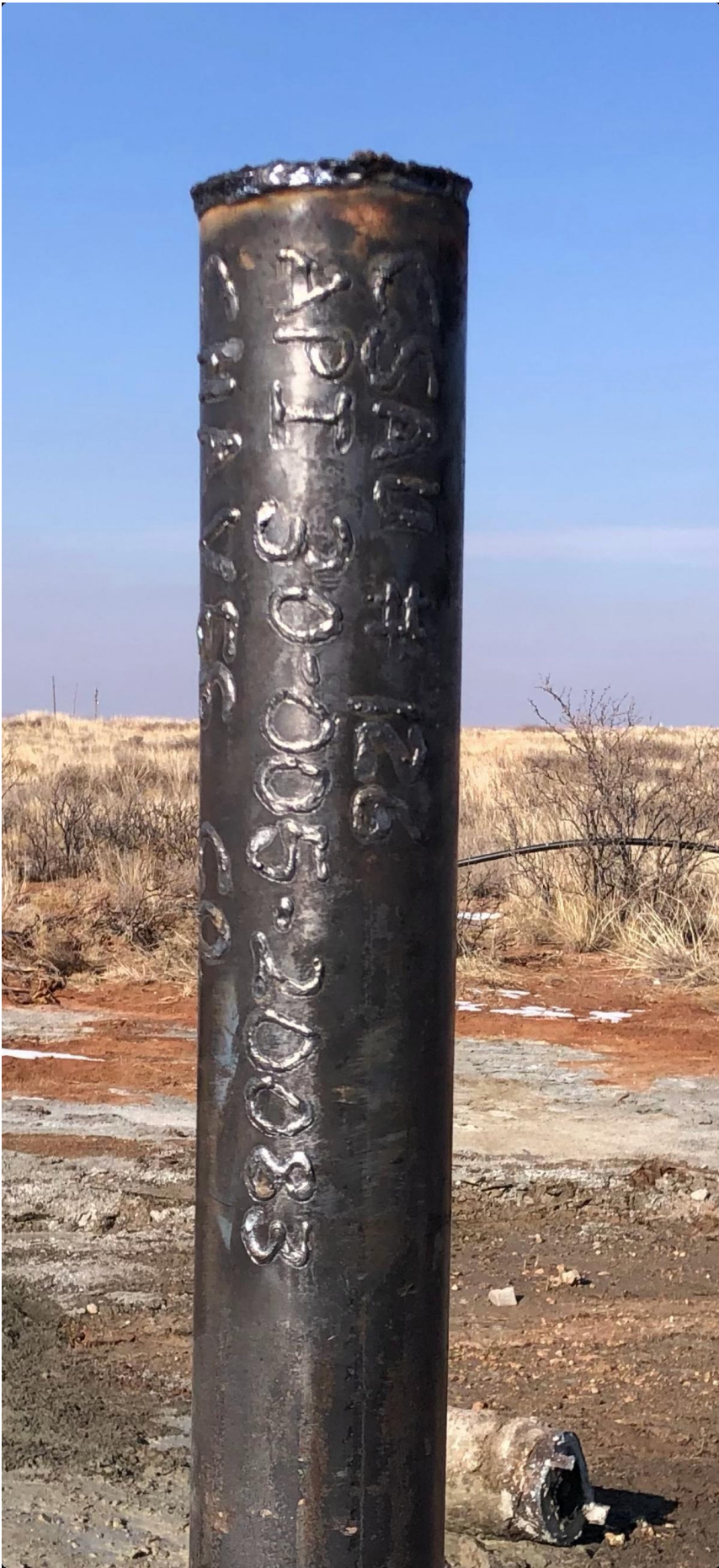
Figure 6: API