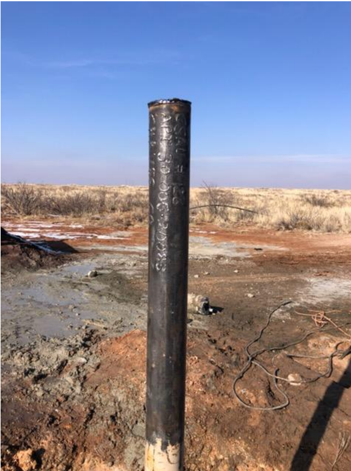
Figure 4: Marker I