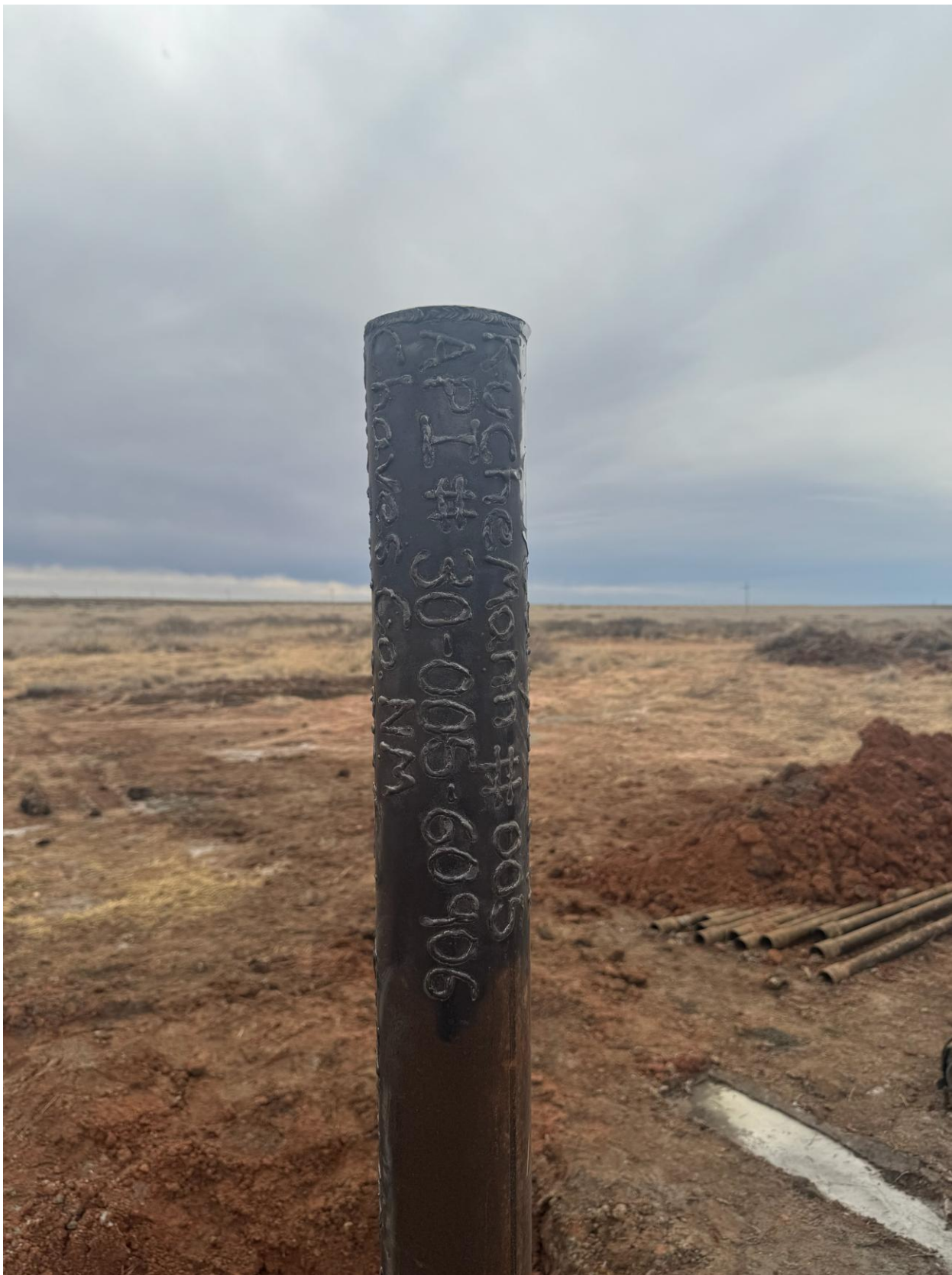
Figure 4: Marker II