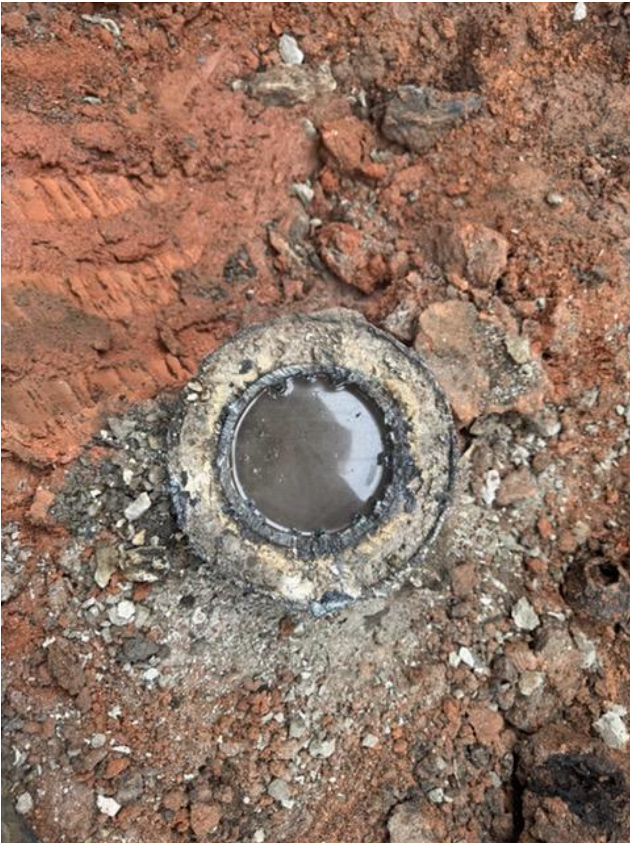
Figure 1: Cut Off