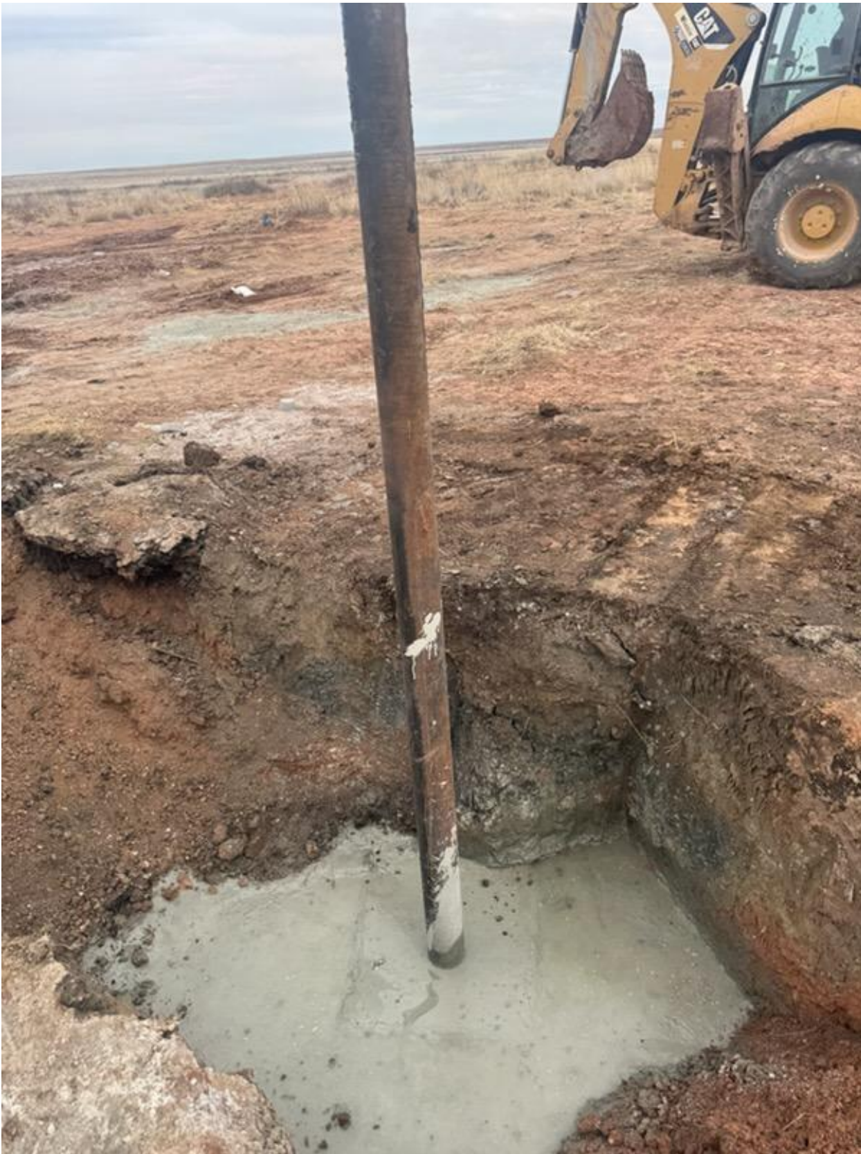
Figure 3: Marker I