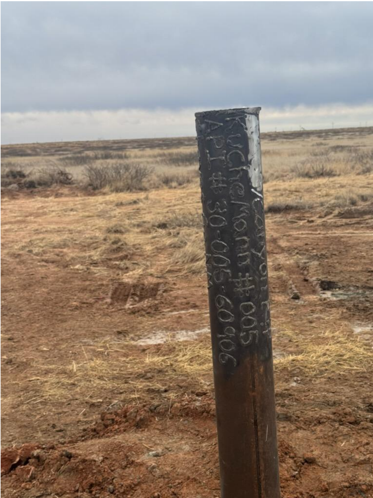
Figure 5: Marker III